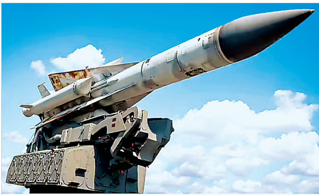
It is a "fire-and-forget" weapon, meaning no further guidance or input is required after firing. This allows the operator to take cover, relocate, or engage a new target immediately. The Stinger missile comprises guidance, tail, propulsion, and warhead systems. The tail section features four foldable fins that provide spin and stability during flight. The guidance system includes a seeker assembly, a guidance unit, a control assembly, a missile battery, and four fins that provide steering control during flight. The warhead weighs approximately 1 pound (0.45 kg). The propulsion section consists of a launch motor and a triple-thrust flight motor.

It is a shoulder-fired weapon that can be operated by a single individual (though a two-person team is typically assigned to the task). It utilizes a passive seeker. The seeker locks onto