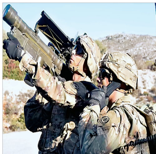
Soviet Union. American experts feared that the technology required to intercept ICBMs in mid-air was

Reagan's plan faced a storm of criticism. European allies were concerned about how the program would alter the balance of power between them and the