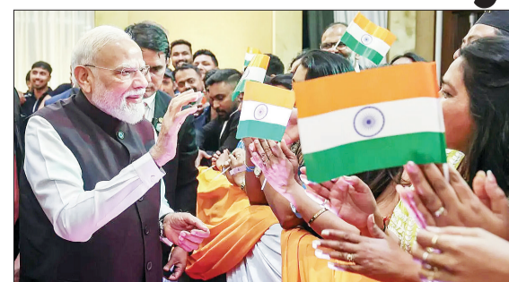
Prime Minister Narendra Modi interacts with members of the Indian community during a welcome ceremony, in Slovakia on Monday.

"This visit provides an opportunity to deepen India-Slovakia relations and explore new avenues of cooperation. Looking forward to productive meetings with President Pellegrini and Prime Minister Fico." The Prime minister arrived in Bratislava on a two-day visit from France where he held bilateral talks with French President Emmanuel Macron in Nice. He also attended the inauguration of the 'Bharat Innovates' event in France.