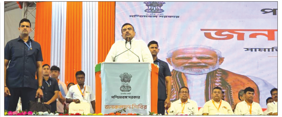
West Bengal Chief Minister Mamata Banerjee, under the initiative of the state government, inaugurated a welfare camp to ensure that the benefits of various social security schemes and civic services reach the people at Reyapara in Nandigram on Monday.