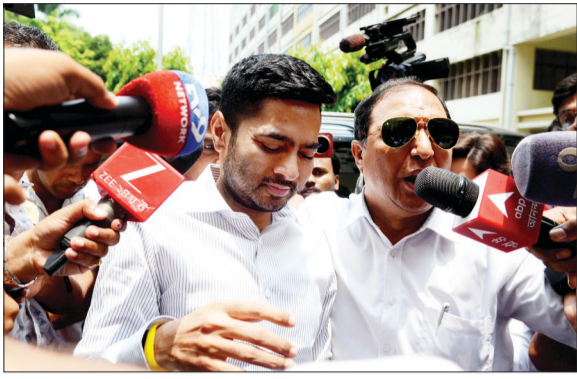
TMC All India General Secretary and TMC MP Abhishek Banerjee arrives at the Enforcement Directorate (ED) office to appear before the agency in connection with its probe into the alleged teachers' recruitment scam in Kolkata on Monday.

Informing this official sources said 'Abhishek Banerjee appeared before the ED officials here at around 11 a.m. for questioning in connection with the alleged West Bengal primary school recruitment scam. His appearance followed a summons issued earlier this month as part of the agency's ongoing money-laundering investigation into alleged irregularities in teacher recruitment scam.' The ED has been probing the recruitment scam since 2022 and is examining alleged financial transactions linked to entities under scrutiny. However,