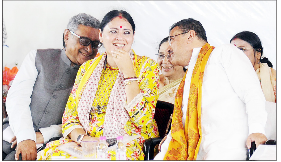
West Bengal Chief Minister Suwendu Adhikari was in conversation with State Finance Minister Swapan Dasgupta, along with State Urban Development Minister Agnimitra Paul, during a Kolkata Municipal Corporation programme held at the KMC headquarters on Monday.

The CID probe is linked to the alleged forgery of TMC MLAs' signatures on documents regarding the appointment of the Leader of the Opposition in the State Assembly. The ED is questioning him over the alleged money laundering angle, financial transactions, bank records, and digital documents linked to the case.