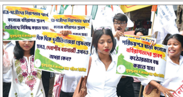
Law students of Surendranath College, under the banner of the Congress Chhatra Parishad, held a protest march on June 15, 2026, against the ongoing unrest on campus, expressing concerns over the safety of female students and the institution's reputation on Monday.