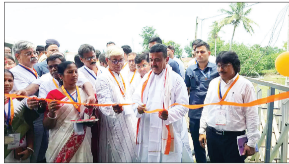
West Bengal Chief Minister Suwendu Adhikari inaugurating Jan Kalyan Shivar which, he says, will help people to get access to 54 state and central govt schemes.

"We want benefits to reach genuine beneficiaries and not to fake account holders," he said. Long queues of applicants were seen at several locations on the opening day. The camps will cover 54 schemes, including Annapurna Yojana, Ayushman Bharat and several other welfare programmes. Earlier last week the Centre had announced an interim allocation of Rs 95,692 crore under the newly introduced VB-G RAM G scheme for a seamless transition, with Union Rural Development Minister Shivraj Singh Chouhan asserting that no state would face any dearth of funds. He said the interim allocation had been made as the draft rules of the new scheme were still being finalised and ensure that rural employment and development activities will continue uninterrupted after June 30. "Without causing any inconvenience to workers, we are moving from the Mahatma Gandhi National Rural Employment