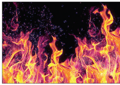
blaze. Two people died, and seven others were seriously injured in a fire that broke out at a restaurant cum pub in Mysuru's RT Nagar on Monday, police