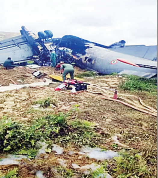
Indian Air Force AN-32 transport aircraft crashed in a tragic accident while landing at the Jorhat airbase in Assam on Saturday.

Senior IAF officials reached the site after the accident and