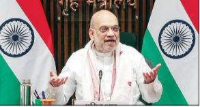
Home Minister Amit Shah.

MI News Service, New Delhi: Union Home Minister Amit Shah on Saturday directed the high-level committee on demographic change to study the shift in population structure in border districts, officials said.