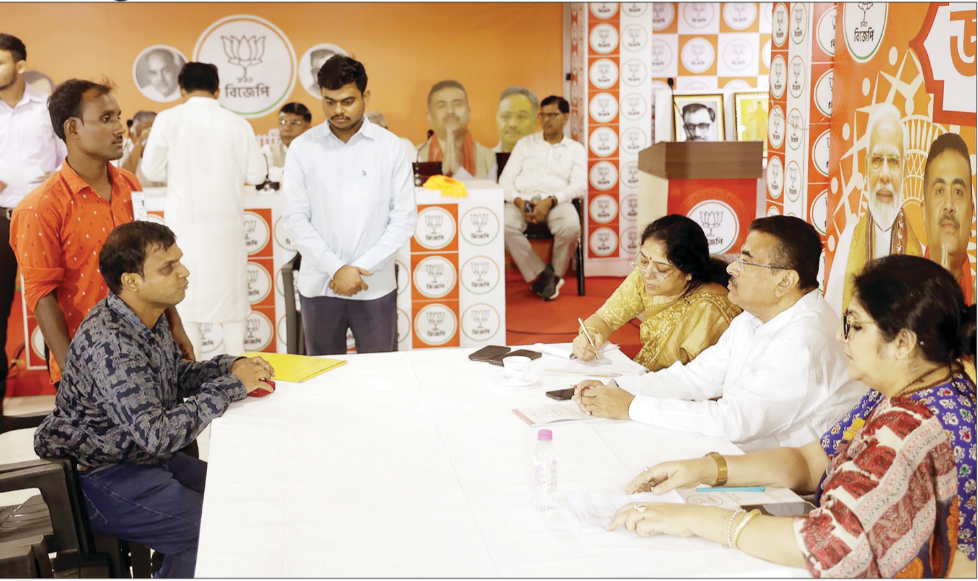
Chief minister Suvendu Adhikari listens to public grievances at 'Janatar Darbar' at BJP party office at Salt Lake City in Kolkata on Saturday.

MI News Service, Kolkata: For the fourth time within a month of taking charge, West Bengal Chief Minister Suvendu Adhikari held yet another 'Janatar Darbar' at the BJP office on Saturday, where he listened to people's grievances on several issues and instructed officials to redress them promptly.