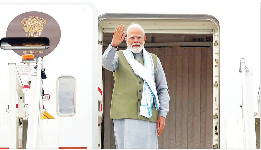
Prime Minister Narendra Modi on Saturday left for a week-long visit to France and Slovakia, during which he will attend the G7 Summit and hold discussions with world leaders on a range of bilateral and global issues.

"This is the eighth consecutive G7 Summit to which India has been invited. At the G7, India will not only speak for it-