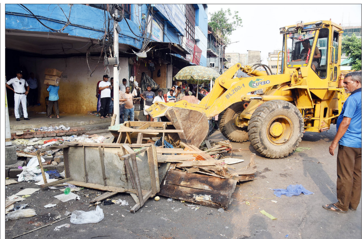
Hog Market hawkers face eviction in a Kolkata clearance operation on Saturday.