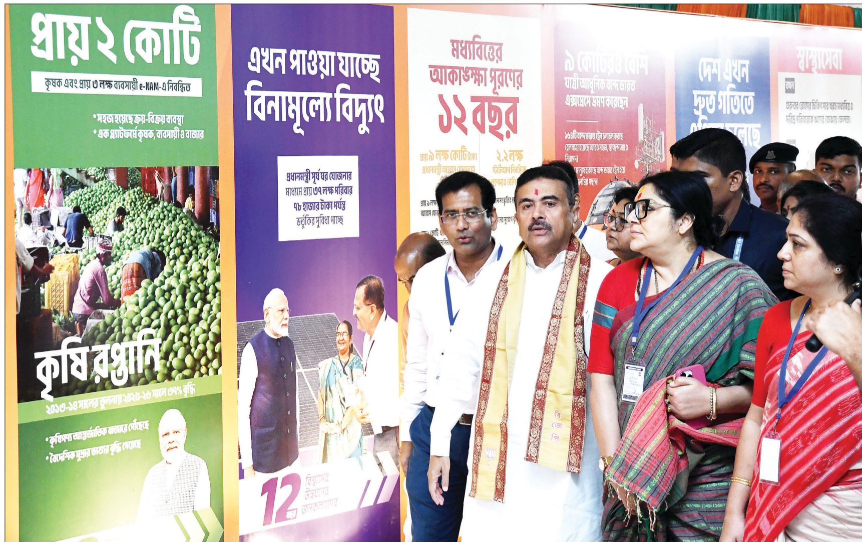
West Bengal Chief Minister Suwendu Adhikari inaugurated an exhibition at Biswa Bangla Convention Centre in Kolkata on Friday. The exhibition depicted various schemes introduced by Prime Minister Narendra Modi at different stages in his 12 year tenure.