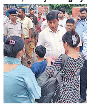
through stations and trains in Sonarpur-Canning section, the localized drive proved highly effective, catching hundreds of offenders off guard. A total of 618 cases of various violations were registered during the operation, resulting in the realization of ₹1,47,685 in fines, in which Without-Ticket 449 cases, Unbooked Luggage 128 cases and Anti-Spitting & Littering cases 41.