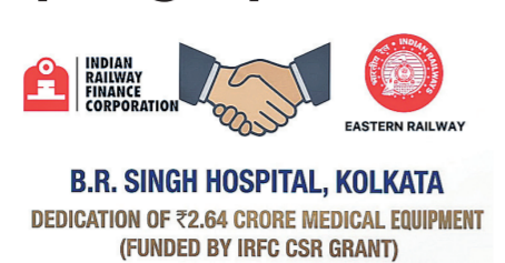
B.R. SINGH HOSPITAL, KOLKATA DEDICATION OF ₹2.64 CRORE MEDICAL EQUIPMENT (FUNDED BY IRFC CSR GRANT)