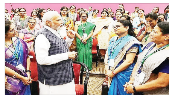
PM Narendra Modi with women.

MI News Service, New Delhi: Prime Minister Narendra Modi on Friday said the NDA government's efforts are rooted in dignity, opportunity and empowerment, and these have helped create an environment where women can realise their full potential and contribute even more strongly to nation-building.