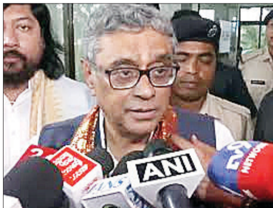
State Finance Minister Swapan Dasgupta.

pan Dasgupta, such a 'Marshall Plan' is the only one that can revive the devastated economy. However, Swapan himself believes that it is a big challenge for Bengal. How will that plan work? The Finance Minister said that restoring financial discipline, investment and government aid - all of these must be combined to create an ideal plan. He hopes that the double engine government in the state at this moment will greatly help in implementing that plan. The financial aid of the center, the support of various financial institutions and above all, several development projects of the center are going to be included in this 'Marshall Plan'. In this context, Swapan talked about several projects like Jiramji Project i.e. 100 days of work, Pradhan Mantri Gram Sadak Yojana, Pradhan Mantri Awas Yojana. The Finance