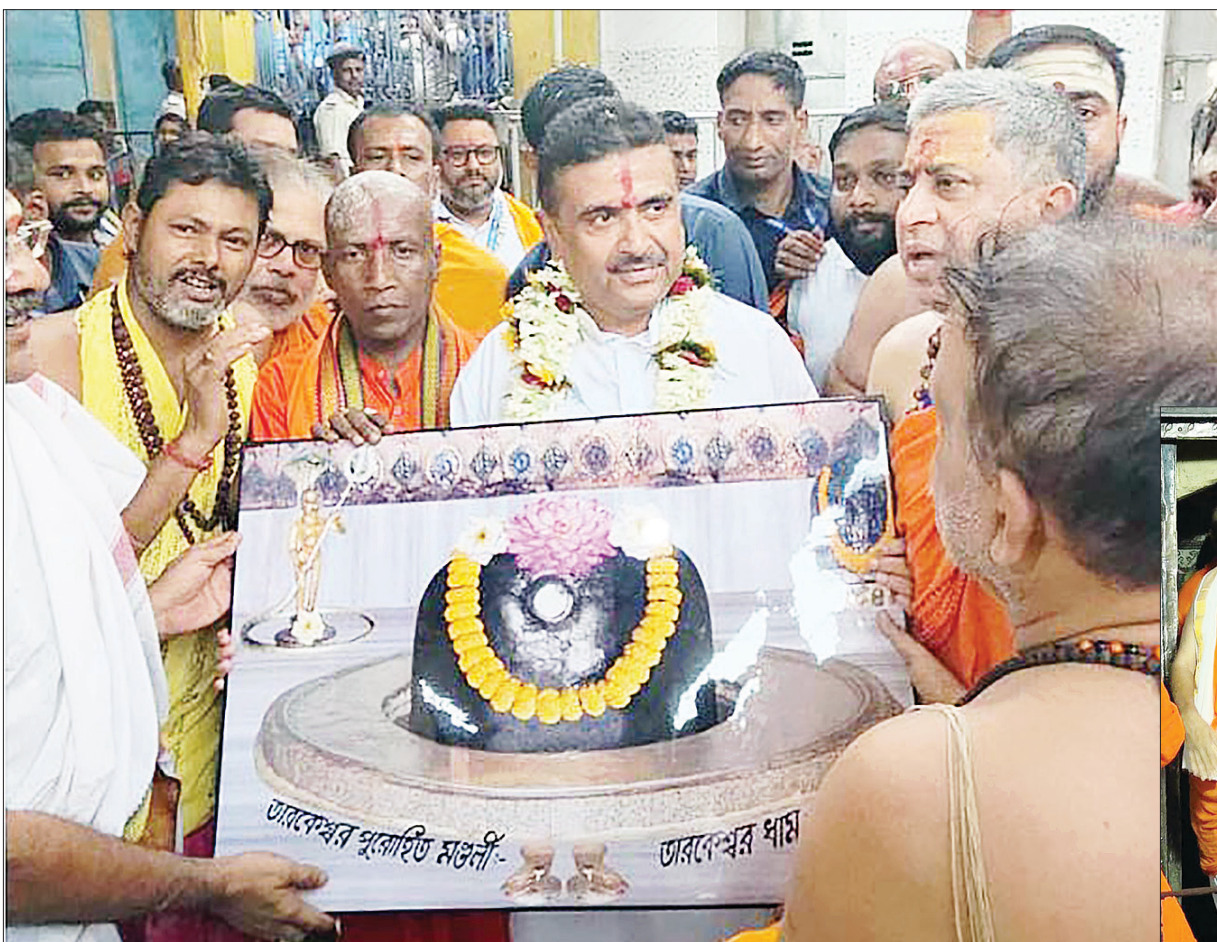
West Bengal Chief Minister Suwendu Adhikari visited Shri Mahadev Temple in Tarakeswar, Hooghly, on Tuesday and offered prayers

Governor RN Ravi administered the oath of office and secrecy to the new ministers at Lok Bhawan in Kolkata.