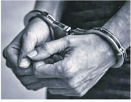
ing equipment proved crucial in exposing the smuggling operation.

Officials stated that the smugglers had adopted a sophisticated concealment strategy, making it difficult to identify the illicit consignment solely through visual inspection. The use of technical screen-