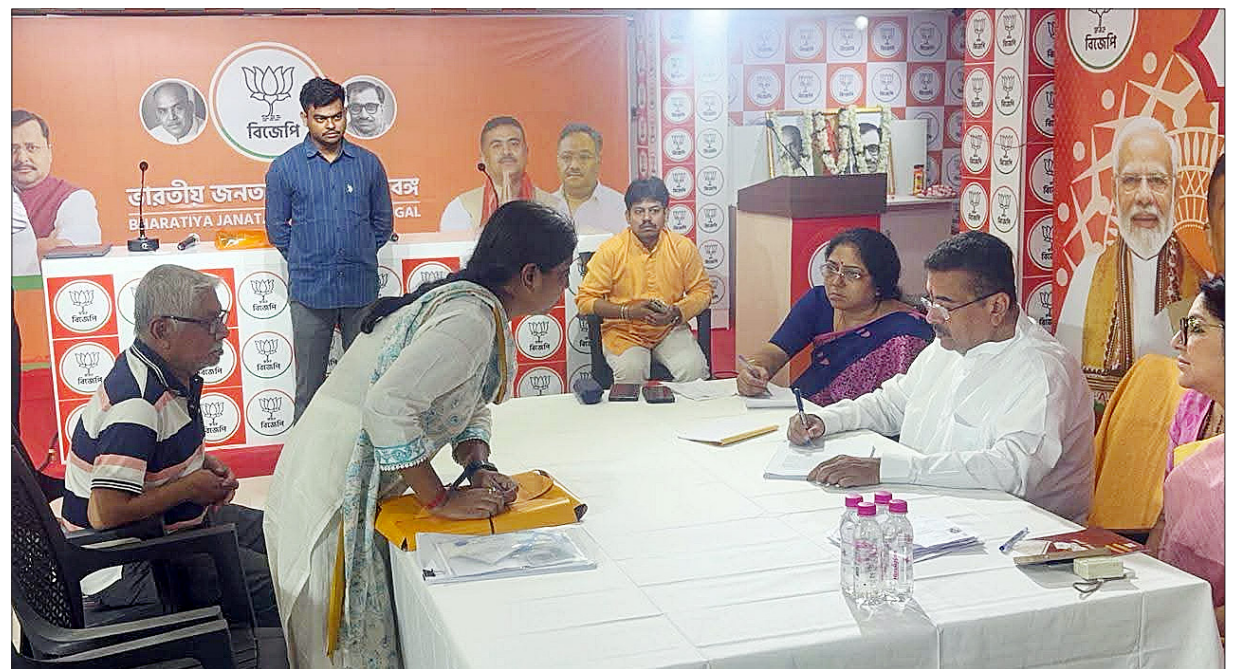
West Bengal Chief Minister Suvendu Adhikari listened to the grievances of the people and assured them of genuine solutions during the 'Janatar Darbar' (People's Court) at the state BJP office on Tuesday.

With humidity remaining high and rainfall unlikely, relief from the scorching and uncomfortable weather conditions appears uncertain in the immediate future.