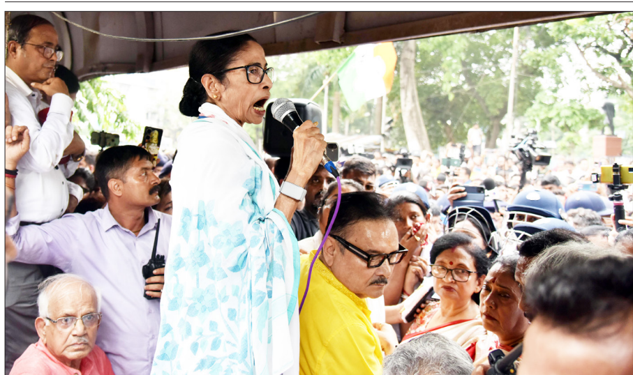
Trinamool Congress (TMC) chief and former West Bengal Chief Minister Mamata Banerjee held a sit-in protest alleging post-poll violence against party workers and her nephew Abhishek Banerjee, as well as a hawker eviction drive. The dharna was held at the Esplanade Y Channel in Kolkata on Tuesday.

Concluded with a commitment from all stakeholders to work in a coordinated manner to strengthen disaster preparedness and ensure an effective response to any monsoon-related challenges.