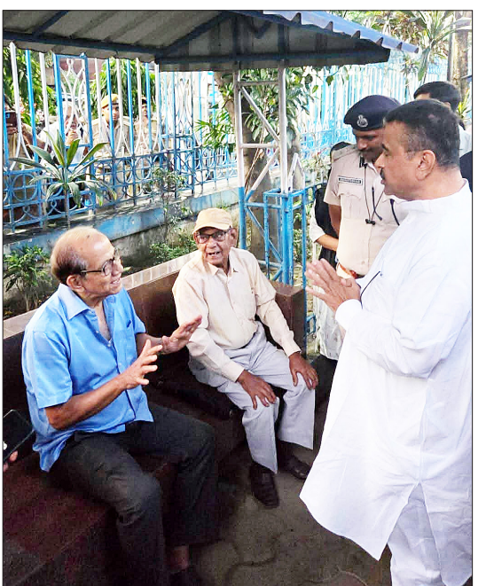
West Bengal Chief Minister Suvendu Adhikari speaks with senior citizens during an inspection visit to Chetta Central Park in Bhawanipore, Kolkata, on Saturday.