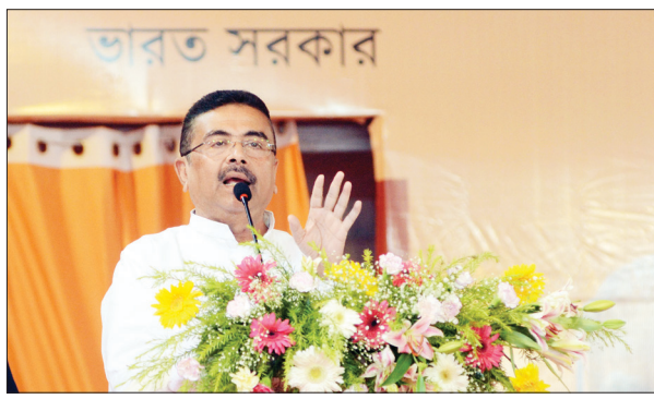
West Bengal Chief Minister Suvendu Adhikari addresses a programme during the inauguration of the cervical cancer vaccination campaign at Bidhannagar Sub-Divisional Hospital on Saturday.

MI News Service, Kolkata: West Bengal Chief Minister Suvendu Adhikari on Saturday signalled a new era of cooperation between the state government and the Damodar Valley Corporation (DVC) ahead of the upcoming monsoon season, ending years of confrontation that marked the previous administration's approach. Speaking after inaugurating the 'Swachh' app in New Town in the presence of Union Minister Manohar Laxkar, the Chief Minister said allegations made by the former Trinamool Congress government against DVC over flooding in the state had been proven false. "Claims that DVC was responsible for flooding during the monsoon were completely untrue. That chapter is over," Adhikari told reporters. He stressed that the state government and DVC are now working in coordination to