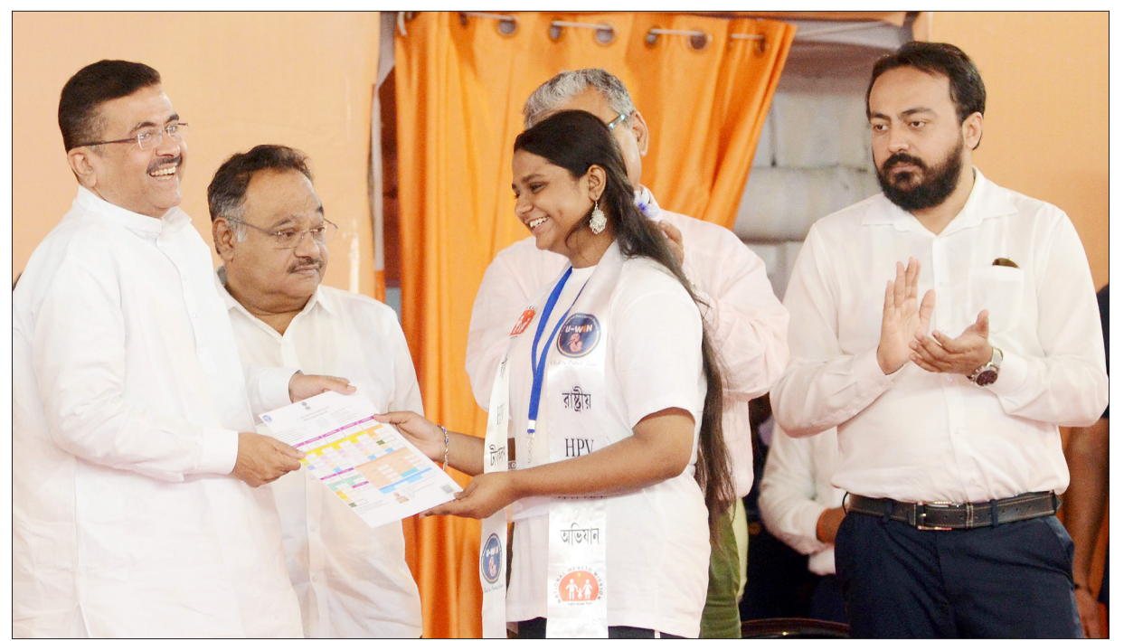
West Bengal Chief Minister Suvendu Adhikari, in the presence of BJP State President Samik Bhattacharya, hands HPV vaccination certificate to a girl who was among the first recipients of the vaccine during a vaccination programme at Bidhannagar Sub-Divisional Hospital in Kolkata on Saturday.

With a "double-engine" government now in power in West Bengal, Adhikari said cooperation rather than confrontation would guide the state's relationship with DVC, particularly in addressing monsoon preparedness and flood management.