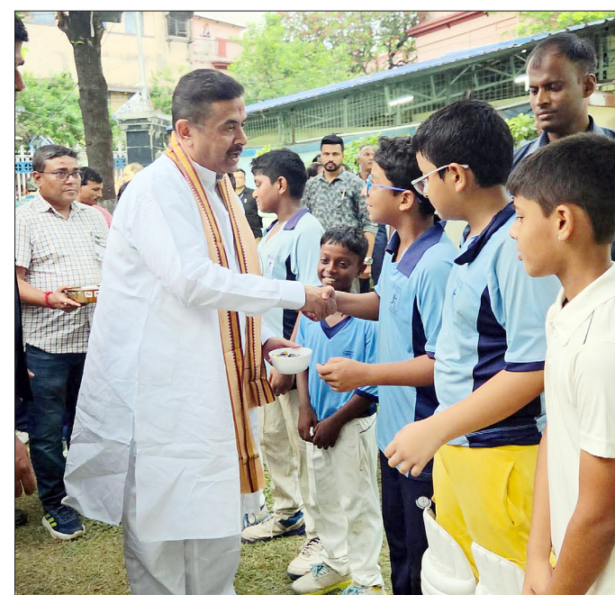
West Bengal Chief Minister Suvendu Adhikari interacts with students at Harish Park in Bhawanipore, Kolkata, on Saturday.

tices and hospital middlemen. He revealed that disciplinary action has already been taken in one such case, with an MSVP of Kolkata Medical College reportedly suspended over the referral of a critically ill patient. The Chief Minister further announced that the National Health Mission (NHM) will be fully implemented in West Bengal from this year. The Government of India has allocated 2,103 crore to the state under the scheme, of which 527 crore has already been released. In addition, West Bengal has received an allocation of 976 crore under the Ayushman Bharat programme. The state government plans to bring more than six crore people from 1.36 crore families under the scheme, enabling beneficiaries, including migrant workers, to access healthcare services across India. Describing the measures as transformative, Adhikari also announced that 467 Pradhan Mantri Jan Aushadhi Kendras will be opened. New medical colleges will be established in Alipurduar, Kalimpong, Dakshin Dinajpur, and Paschim Bardhaman, ensuring that every district in West Bengal has access to medical college facilities and advanced healthcare infrastructure.