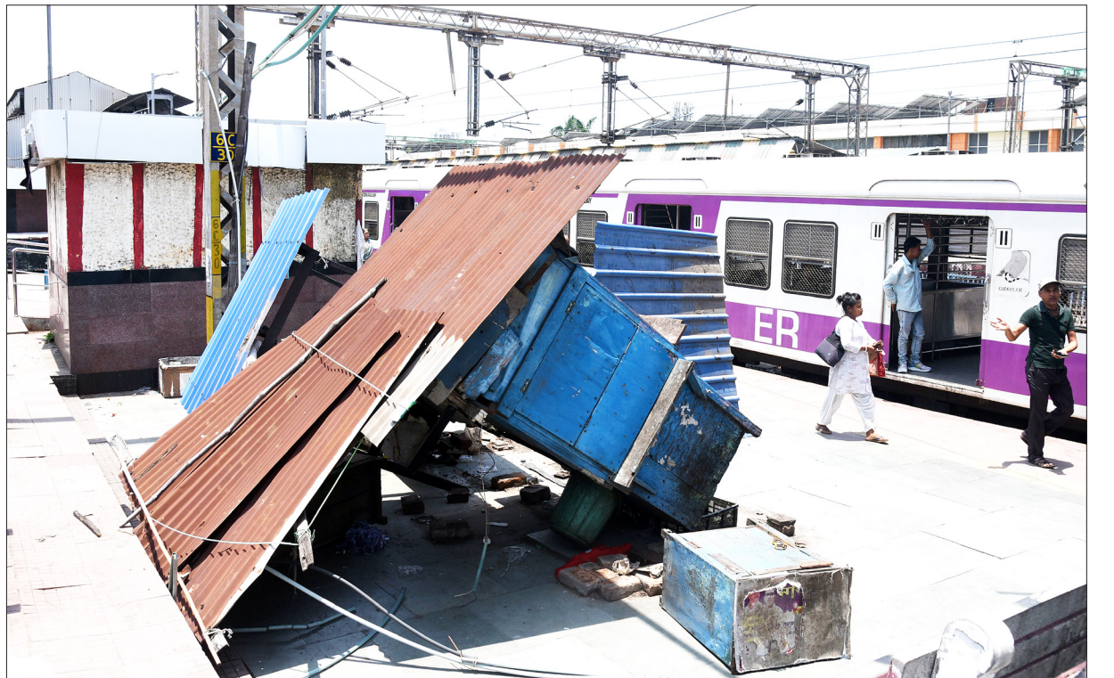
Debris remain at the platform of the Dum Dum Railway Station in Kolkata on Sunday after 'illegal hawker eviction drive'.