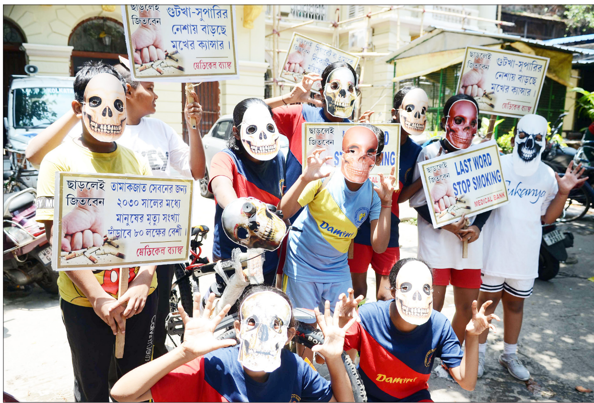
Children are seen wearing skeleton masks during "World No Tobacco Day" awareness campaign in Kolkata on Sunday.