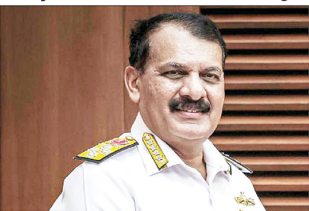
Indian Navy Chief Admiral Dinesh K Tripathi

There has been a significant increase in maritime collaboration between Pakistan and Chi-