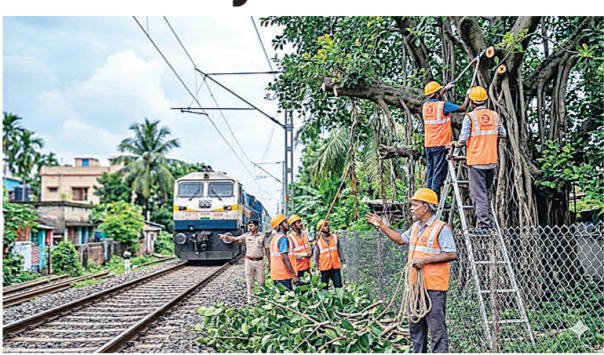
private banner festoons fell onto tracks and Overhead Equipment (OHE) power lines at twelve critical locations—including Dum Dum, Kalyani, Barasat, and Sonarpur. While Eastern Railway's emergency rapid action teams worked under treacherous conditions to clear the tracks and restore power safely, the incident highlights a critical vulnerability: many of the hazardous trees belong to private properties adjacent to railway land.

MI News Service, Kolkata, May 31, 2026 : Following a severe spell of heavy rain and stormy weather that crippled train movements across the Sealdah Division on 29.05.2026 , Eastern Railway has issued an urgent awareness appeal to citizens residing along railway tracks. The railway is calling on local residents to proactively cut vulnerable tree branches on their premises or cooperate fully with railway teams to prevent life-threatening overhead wire entanglements and massive passenger delays.