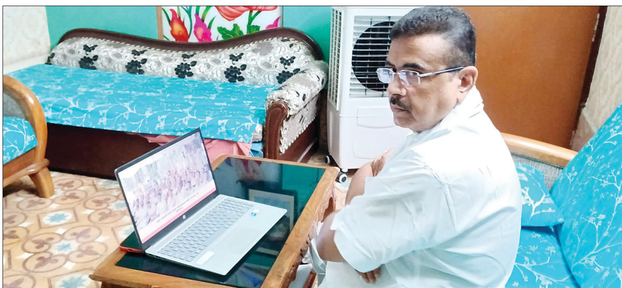
The Chief Minister of West Bengal, Suwendu Adhikari, listened to the 134th episode of the Prime Minister Narendra Modi's 'Mann Ki Baat' via digital media on Sunday.

State urban development minister Agnimitra Paul hosted