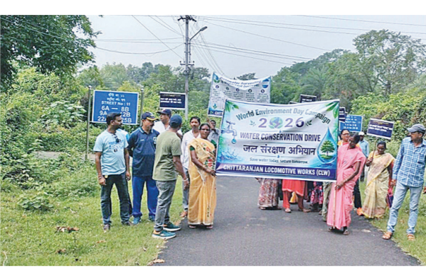
maintaining a healthy water cycle through water conservation efforts. This water conservation drive commenced at the Water Department office and concluded near the

MI News Service, Kolkata, May 31, 2026 : The World Environment Day campaign (spanning from May 15 to June 5, 2026) at Chittaranjan Locomotive Works (CLW) is currently underway, having commenced on May 15, 2026, with a pledge-taking ceremony. Various programs are being organized throughout this period. Under this campaign related to environmental protection and awareness, a 'drive program' was organized in front of the Water Department office today on 31.05.2026. Everyone present pledged to make an active contribution towards