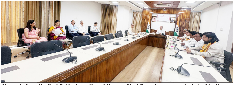
Moments from the first Cabinet meeting of the new West Bengal government, chaired by the West Bengal Chief Minister Suwendu Adhikari at Nabanna on Monday.

MI News Service, Kolkata: Suwendu Adhikari on Monday began allocating portfolios to ministers in the newly formed BJP government in West Bengal following the first Cabinet meeting at Nabanna. The ministers had earlier taken oath at Brigade Parade Ground in the presence of Prime Minister Narendra Modi, though portfolios had not been announced at that time.