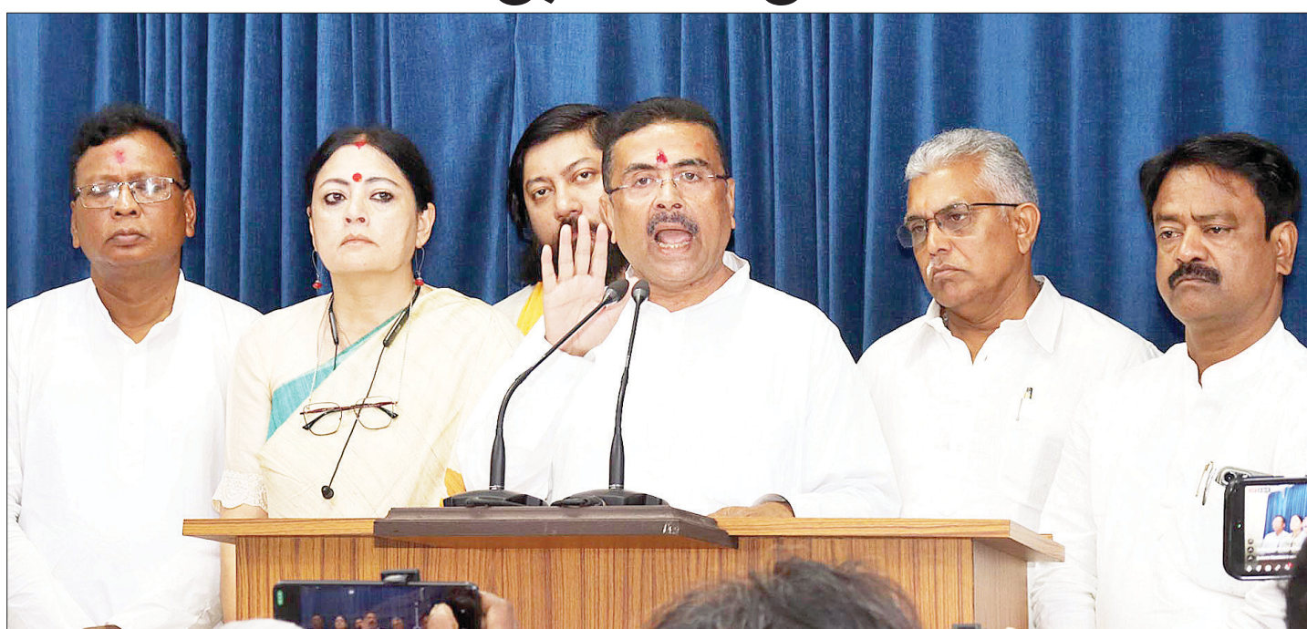
Chief Minister Suwendu Adhikari addressing the media along with other Ministers after the first cabinet meeting at Nabanna on Monday.

He further declared a five-year relaxation in the age limit for government job applicants, fulfilling a promise made by Union Home Minister Amit Shah during electioneering.