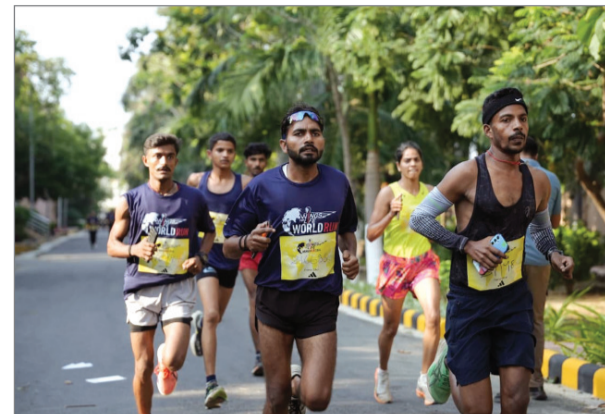
Runners participated in Wings For Life World Run - Organised App Run in Patna. Global run organised by Red Bull with 100 percent of registration/donations being used for spinal cord injury research.

Globally, 346, 527 official registered participants in the Wings for Life World Run 2026. Participants from 192 nations in 173 countries registered for the Wings for Life World Run 2026. There were 7 Flagship Run Locations, 648 App Run events across 73 different countries. That apart participants all over the globe ran in their own capacity. The 2026 edition of Wings for Life raised a total of 69.7 million Euros, all of which will be directed towards better treatment and advanced research for spinal cord