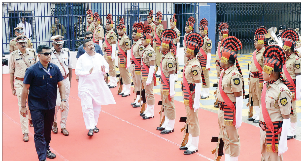
Newly elected Chief Minister of West Bengal Suwendu Adhikari inspects Guard of Honour at Nabanna on Monday

MI News Service, Kolkata: New Chief minister of West Bengal Suwendu Adhikari was given a Guard of Honour by the state police at the state Secretariat 'Nabanna' when he enters there for the first time as the CM on Monday.