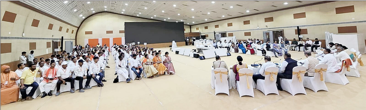
West Bengal Chief Minister Suwendu Adhikari, participated in a meeting with ministers in charge, newly elected MLAs, and secretaries of various departments at the Nabanna conference hall on Monday.

"Administrative instructions have been issued today, and the census process will begin immediately," Adhikari said. He further remarked that the directive was finally being implemented after remaining pending for nearly eleven months.