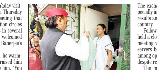
Akhilesh draped an Uttarjaya around Mamata Banerjee and told her, "Didi, you have not lost." Mamata responded by saying, "Yes, we have not lost."

MI News Service, Kolkata: Akhilesh Yadav visited the residence of Mamata Banerjee on Thursday afternoon in a politically significant meeting that has sparked fresh discussions in opposition circles ahead of the upcoming electoral battles in several states. The Samajwadi Party chief was welcomed by Abhishek Banerjee outside Mamata Banerjee's residence in Kolkata.