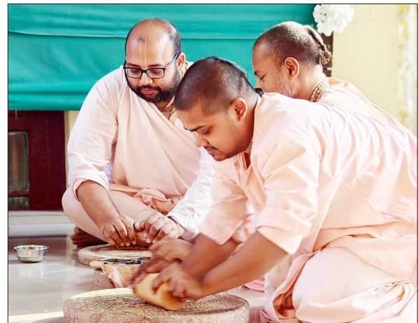
ChandanYatra Festival Begins at Bagbazar Gaudiya Mission on the occasion of Akshaya Tritiya.

MI News Service, Kolkata: The sacred 'ChandanYatra' festival of Lord Krishna began at the Gaudiya Mission on the occasion of Akshaya Tritiya and will continue for 21 days till May 10. Daily rituals and devotional programmes are being held from 6 pm to 9 pm, drawing large numbers of devotees to the temple premises.