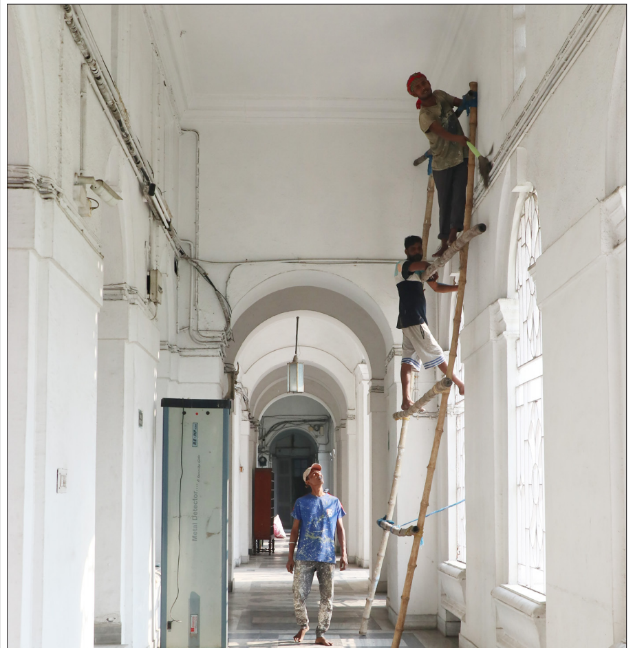
Assembly House is being cleaned and prepared for the newly elected BJP government on Thursday

The meeting comes at a crucial time for the Samajwadi Party, which is preparing for the high-stakes Uttar Pradesh Assembly elections scheduled for early 2027.