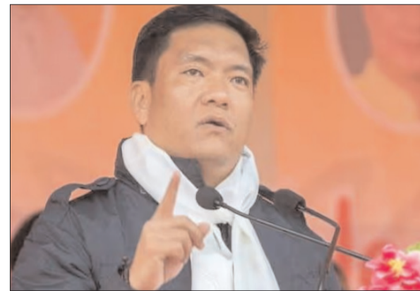
levels. He said state Education Minister P D Sona had earlier

The chief minister also observed that the issue had already been pursued by the state government at various