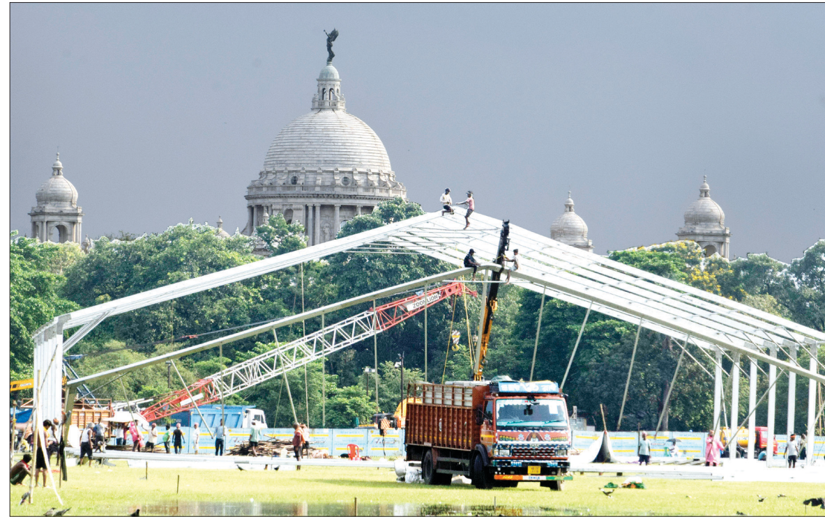
Preparations underway for the oath-taking ceremony of the newly elected BJP government at Brigade Parade Ground on Thursday.