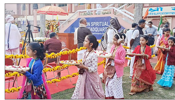
From hundreds of thousands of devotees and pilgrims from India and abroad, including nearly 5,000 international visitors.