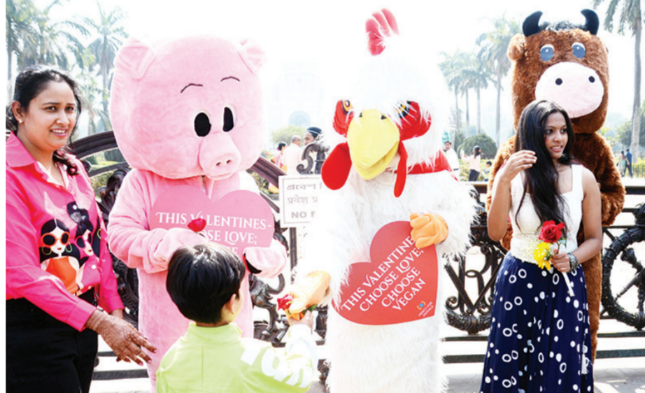
Mercy for Animals activists dressed as a chicken, pig, and cow, engaging with the public to distribute roses, symbolizing love and compassion for all animals "This Valentine's - Choose Love; Choose Vegan" in front of Victoria Memorial, in Kolkata on Friday.

gratulated Tarique Rahman, highlighting the importance of democratic and inclusive governance. Posting on X, Modi wrote, "I convey my warm congratulations to Mr. Tarique Rahman on leading BNP to a decisive victory in the Parliamentary elections in Bangladesh. This victory shows the trust of the people of Bangladesh in your leadership." He added, "India will continue to stand in support of a democratic, progressive and inclusive Bangladesh. I look forward to working with you to strengthen our multifaceted relations and advance our common development goals." The mention of "inclusive" comes amid concerns for minority communities in Bangladesh following political unrest after the ouster of Sheikh Hasina in 2024. Mamata's statement came shortly after the official results were declared for 297 of 300 seats, underscoring her prompt acknowledgment of the electoral outcome and her commitment to fostering strong regional ties. Observers note that both her and Modi's statements signal India's intent to maintain cordial and cooperative relations with the new BNP-led government.