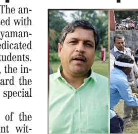
Revival of traditional rural games. The iron ball throw competition tested strength and skill, with winners determined by the distance achieved. In the adapted 'pot-breaking' event, participants-blindfolded-attempted to strike a drum using a long bamboo stick, relying solely on sound cues to locate the target.

MI News Service, Krishnanagar: The annual winter sports meet was celebrated with enthusiasm at Helen Keller Smriti Vidyamandir, the first school in Nadia district dedicated to visually impaired and deaf-mute students. Inspired by the ideals of Helen Keller, the institution has long been working toward the holistic development of children with special needs.