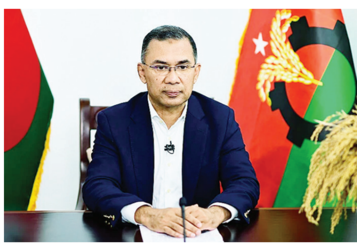
Bangladesh Nationalist Party Chairperson Tarique Rahman poses for a photograph in his party office in Dhaka, Bangladesh.

MI News Service, Dhaka: Less than two months after returning from nearly two decades of self-imposed exile in London, Tarique Rahman is set to win one of Bangladesh's most pivotal elections and become prime minister, leading the country as his parents once did. A coalition led by his Bangladesh Nationalist Party (BNP) won in a big way in the parliamentary election defeating Jamaat led alliance. Thursday's election marked a remarkable reversal of fortune for the soft-spoken 60-year-old, who left the country in 2008 saying he needed medical treatment after his release from detention under a military-backed caretaker administration. He had been held after a crackdown on corruption. He returned home to a hero's welcome last Christmas after a youth-driven uprising uprooted the BNP's arch-enemy, long-time premier Sheikh Hasina of the Awami League, in August 2024. Hasina, now in exile in New Delhi, and Rahman's mother, Khaleda Zia, long dominated Bangladeshi politics, while Rahman's father was a leading Bangladesh independence figure who ruled the country from 1977 to 1981 before he was assassi-