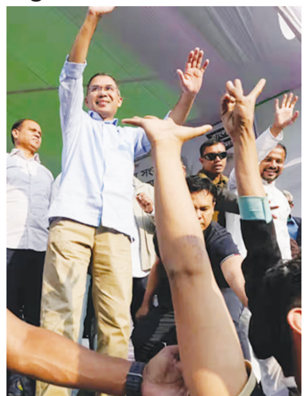
Tarique Rahman, the son of former Prime Minister Khaleda Zia and chairman of the Bangladesh Nationalist Party (BNP). Celebrates BNP's victory in Bangladesh poll with his supporters in Dhaka.

MI News Service, Dhaka: The Bangladesh Nationalist Party (BNP) has secured a landslide victory in the country's first parliamentary elections since the deadly 2024 uprising that forced then-prime minister Sheikh Hasina from office. The BNP is led by 60-year-old Tarique Rahman, its prime ministerial candidate, who returned to Bangladesh in December after spending 17 years in self-exile in London. He is the son of former Prime Minister Khaleda Zia, who passed away in December. The contest was largely a two-way race between the BNP and an 11-party alliance led by the Islamist Jamaat-e-Islami,