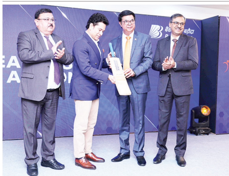
Bank of Baroda's Global Brand Ambassador Sachin Tendulkar with the Bank's Executive Directors at the 'Leadership in Action' Meet in Kolkata on Friday.

According to directives, all District Election Officers (DEOs) must personally verify by 5 p.m. on February 16 that every uploaded document adheres to the approved list. Any unauthorized material found after this deadline will result in personal accountability for the respective DM. IT teams have also been instructed to maintain strict monitoring. The Commission warned that all documents and decisions will remain in the system for several years. If the name of any foreign citizen appears on the voter list—even after one, two, or five years—legal action will be initiated against the responsible officials. During the meeting, officials were cautioned that the process carries long-term administrative risks. Specific reprimands were issued to DMs of Cooch Behar, Jalpaiguri, Malda, South and North 24 Parganas, and East Medinipur for lapses. The DM of East Burdwan was advised against making political comments, while the Cooch Behar DM was censured for delays in document uploads. South 24 Parganas officials were questioned about the authority under which EROs and AEROs summoned EROs. All observers were instructed to report any negligence by EROs, AEROs, or DEOs directly to the Commission.