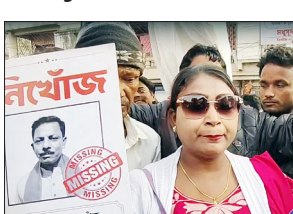
Citizens' society protests with missing person posters in hand.