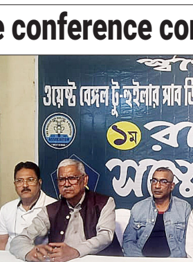
spread across different districts and consciously became actively involved with their own district organizations, which made our organization more coherent and strong.

MI News Service, North 24 Pgs: The first annual state conference was conducted on 12 Feb 2026 by the Resellers Association with the sub-dealers of Barasat in North 24 Parganas.