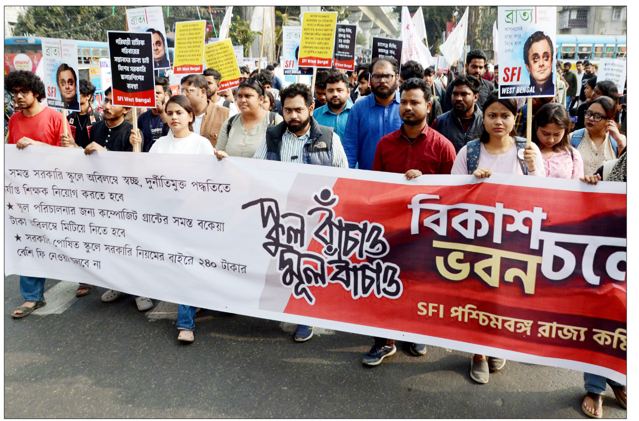
Members of Students' Federation of India (SFI) Participate in Protest Rally Over Demands During March to Bikash Bhawan in Salt, Kolkata, on Friday.