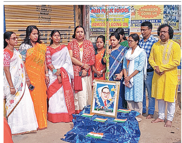
Mass Public School and Progress Coaching Centre and Mallickpur Youth Computer Training Centre celebrated 77th Republic Day at the school gate. All the teachers and students were present on the auspicious day with immense fervor. National flag was hoisted and National song was sung.

Other provincial leaders have also rebuked the meetings between U.S. officials and the Alberta separatist group, with British Columbia Premier David Eby terming them as "treason." "To go to a foreign country and to ask for assistance in breaking up Canada, that's an old-fashioned word for that, and that word is treason," Eby told reporters on Thursday.