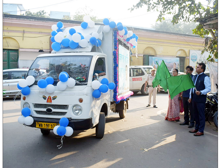
A dedicated tableau, a LED van, designed to showcase the "Banglar Bari" (Housing for All) initiative, was flagged off by the District Magistrate and other officials to spread awareness across South 24 Parganas district in West Bengal.

Adding a strong cultural and national dimension, the pavilion commemorates 150 years of 'Vande Mataram', paying tribute to Shri Bankim Chandra Chatterjee and honouring the national song that continues to inspire generations. A physical selfie point further celebrates the leadership and vision of Indian aviation under the guidance of Hon'ble Prime Minister Shri Narendra Modi, reflecting the government's commitment to transforming India into a global aviation hub. Through innovation, inclusivity, and cultural pride, the Airports Authority of India pavilion at Wings India stands as a compelling narrative of India's aviation past, present, and future.