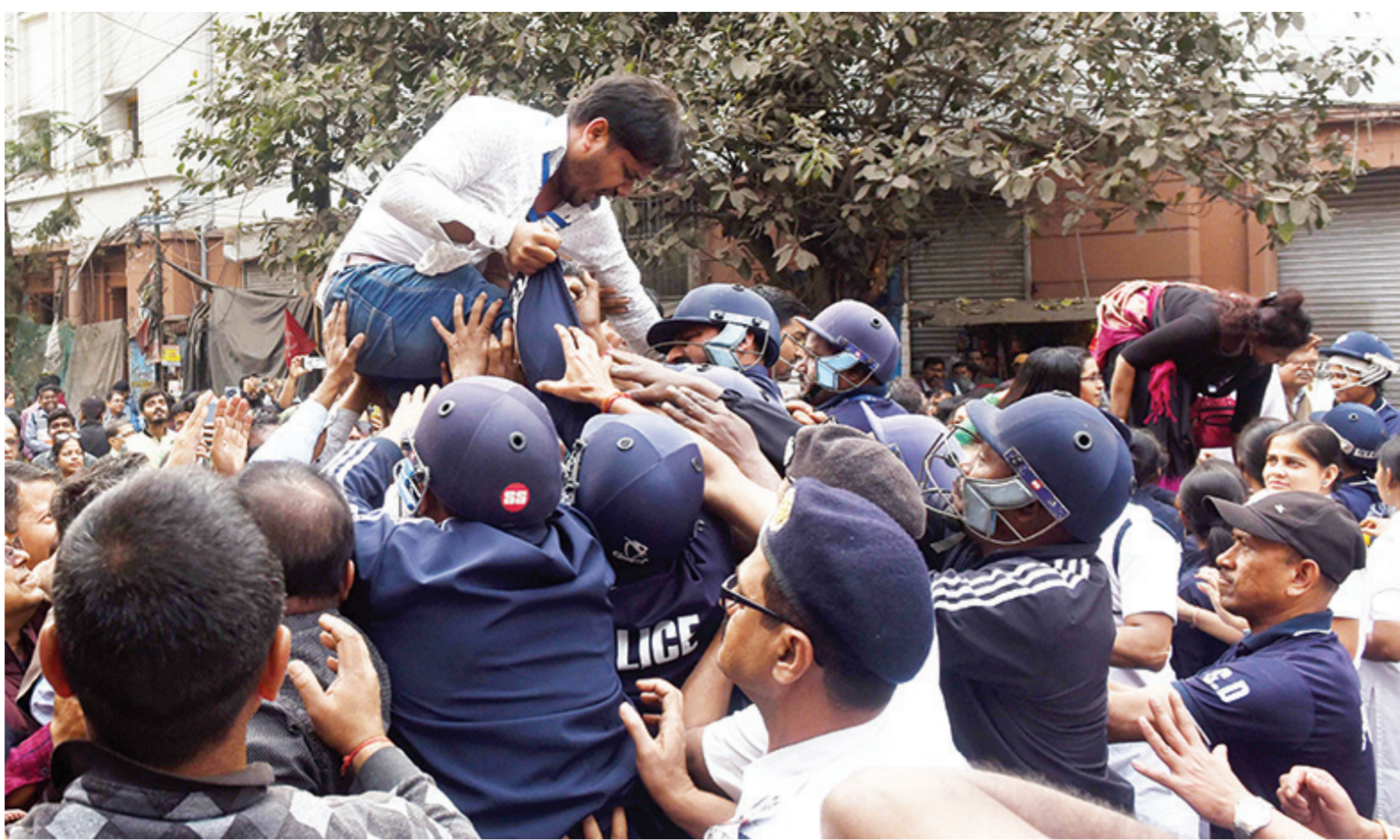
BLOs demonstrating and protesting in front of Election Commission office in Kolkata on Friday.