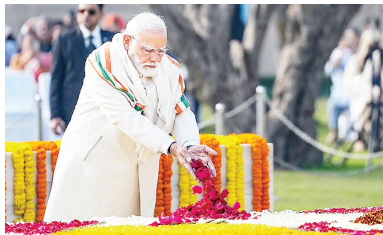
Prime Minister Narendra Modi pays tribute to Mahatma Gandhi at Rajghat on the occasion of Martyrs' Day, observed to mark the death anniversary of the father of the nation, in New Delhi.

India observes the death anniversary of Mahatma Gandhi as Martyrs' Day to honour the life and legacy of the nation's foremost leader and his ultimate sacrifice for peace, justice, and freedom. PM Modi also paid floral tribute to Mahatma Gandhi at Raj Ghat where a prayer meet was held at the memorial and Mahatma Gandhi's favourite devotional songs, including "Raghupati