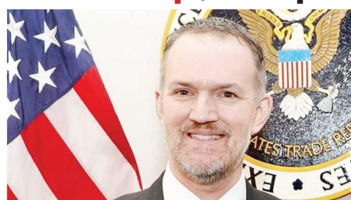
U.S. Trade Representative Jamieson Greer.

MI News Service, New Delhi / Washington (DC): India came out on "top" in the trade deal with the European Union and is going to have a heyday with this, US Trade Representative Jamieson Greer said in the first reaction from the Trump administration on the free trade agreement. Greer was responding to a question on the trade agreement, billed as the "mother of all deals", sealed between India and the EU in New Delhi on Tuesday. "I've looked at some of the details of the deal so far. I think India comes out on top on this, frankly. They get more market access into Europe," Greer said in an interview with Fox Business on Friday.