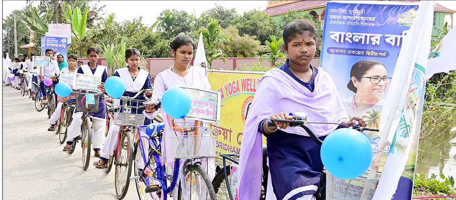
To promote community participation and spread awareness through IEC activities under the Banglar Bari Grameen scheme, a cycle rally was organised on Friday at Sridham Gangasagar, Sagar Block. The rally was flagged off by Minister Bankim Chandra Hazra, inspiring active public involvement and collective commitment towards safe and permanent housing for all financed by the Govt of West Bengal.