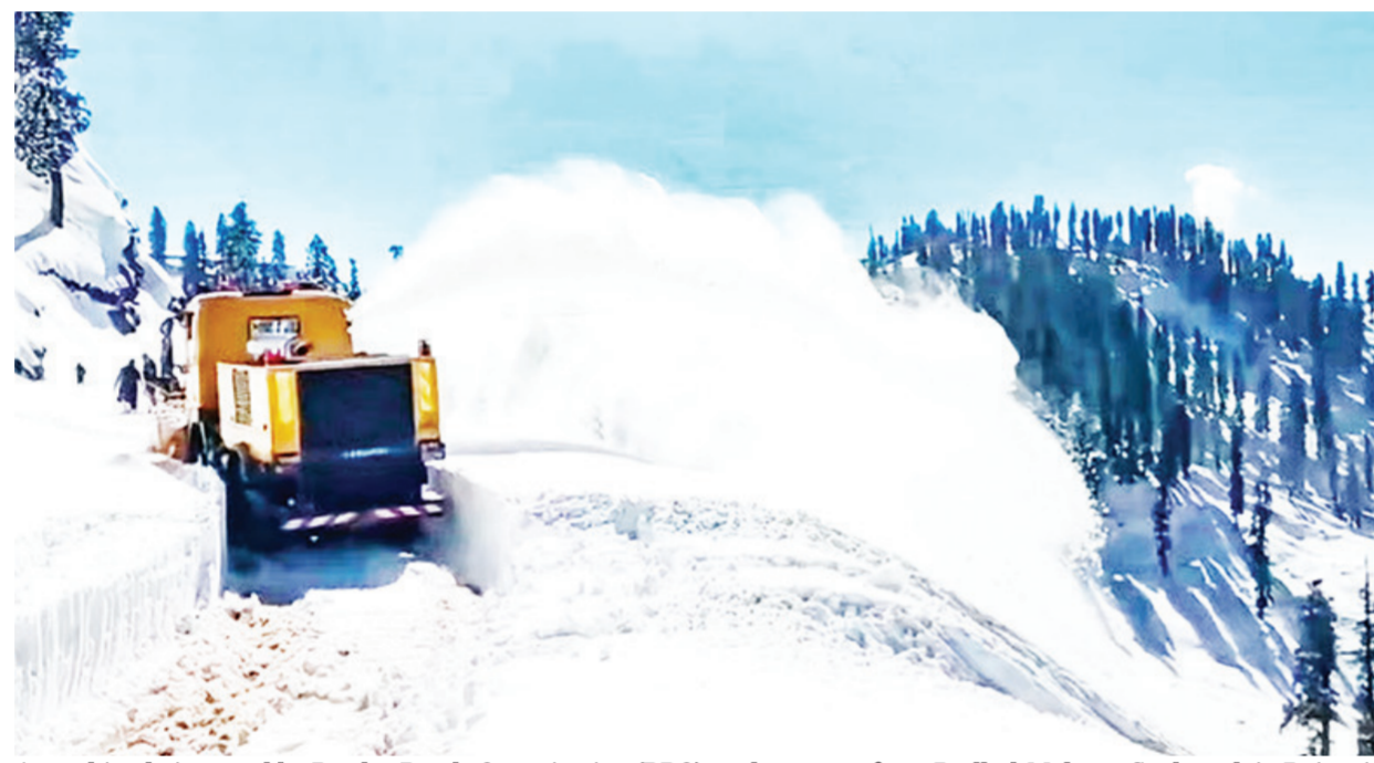
A machine being used by Border Roads Organisation (BRO) to clear snow from Budhal-Mahore-Gool road, in Rajouri, Jammu and Kashmir.