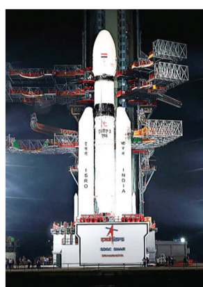
The communication satellite developed by the U.S.-based AST SpaceMobile will be launched as part of the LVM3-M6 mission

MI News Service, Sriharikota: ISRO's upcoming LVM3 M6 mission will carry the BlueBird Block-2 satellite into orbit on December 24, as part of a commercial deal with US-based AST SpaceMobile. The historic mission will deploy the next-generation communication satellite designed to provide high-speed cellular broadband directly to smartphones worldwide.