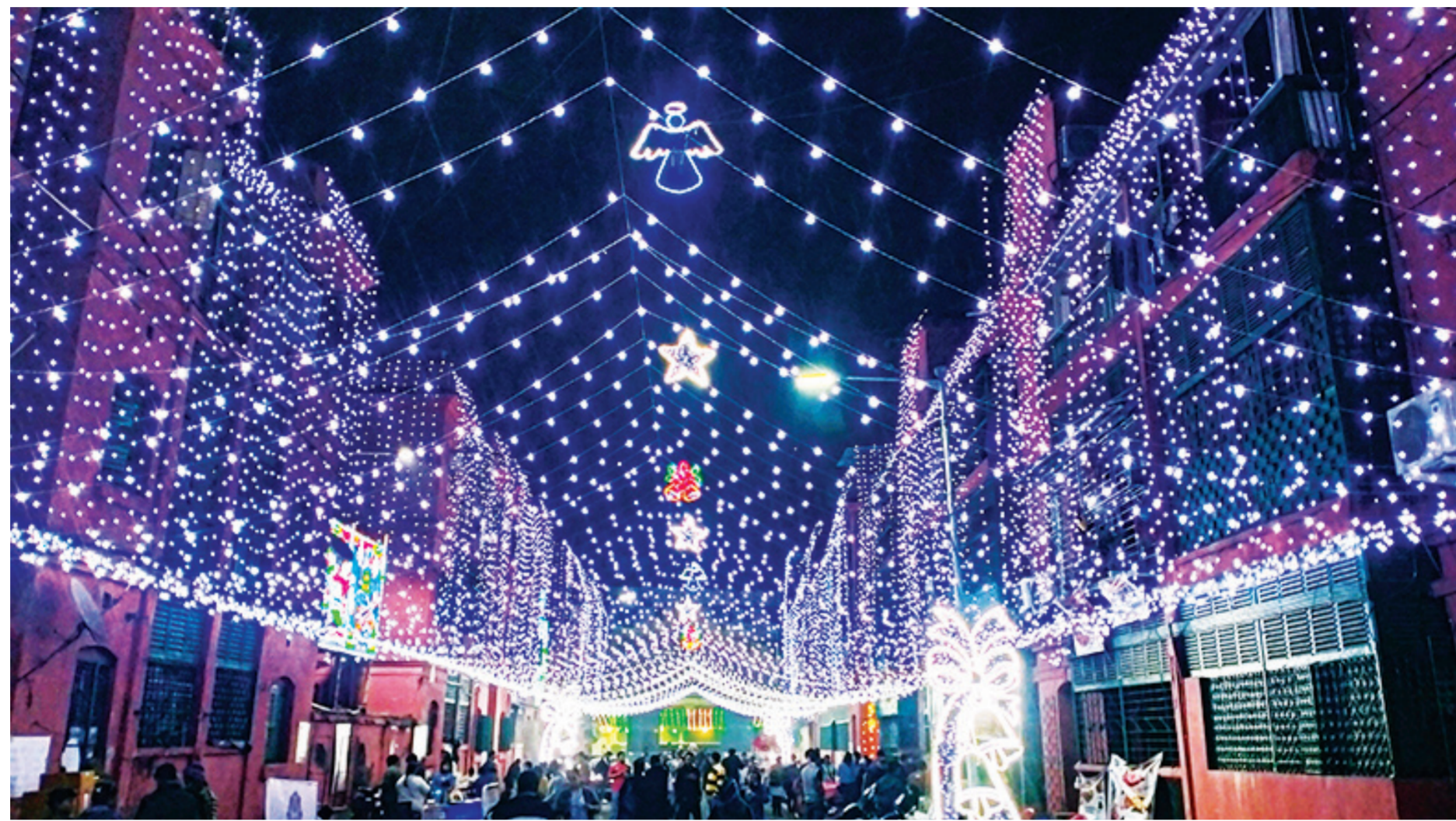
Awe-inspiring illumination at Bow Barracks in Kolkata marks the pre-Christmas celebration on the last Sunday before the Holy Christmas Day.

ity of India (AAI) issued an advisory on Sunday, warning that fog conditions in parts of northern India are affecting visibility and may lead to delays or changes in flight operations at select airports. "Fog conditions in parts of Northern India are affecting visibility and may lead to delays or changes in flight operations at select airports. Passengers are advised to check flight updates with their airlines through official channels and allow extra time for airport travel and formalities," AAI's advisory read. The air quality in the national capital was recorded in the "very poor" category on Sunday morning, with an overall Air Quality Index (AQI) reading of 386, according to the Central Pollution Control Board (CPCB). Data from the CPCB's Sameer app revealed that 16 monitoring stations in the city reported air quality in the "severe" category, while the remaining stations recorded "very poor" levels. As per CPCB standards, an AQI between 0 and 50 is considered "good", 51 to 100 "satisfactory", 101 to 200 "moderate", 201 to 300 "poor", 301 to 400 "very poor", and 401 to 500 "severe". The minimum temperature settled at 9.4 degrees Celsius, which is 1.3 degrees above the season's average, while the humidity was recorded at 91 per cent at 8:30 am, according to the India Meteorological Department (IMD). The maximum temperature is expected to hover around 17 degrees Celsius, with the IMD forecasting a yellow alert for the city due to moderate fog.