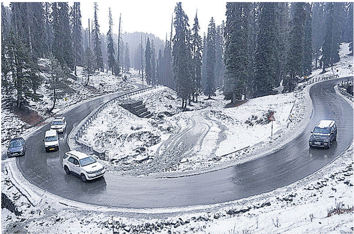
Vehicles pass through a snow-covered valley after fresh snowfall on the first day of 'Chillai Kalan', in Gulmarg, Baramulla district, Jammu and Kashmir. 'Chillai Kalan' is a 40-day harsh winter period in Kashmir which begins on December 21 every year and ends on January 31.