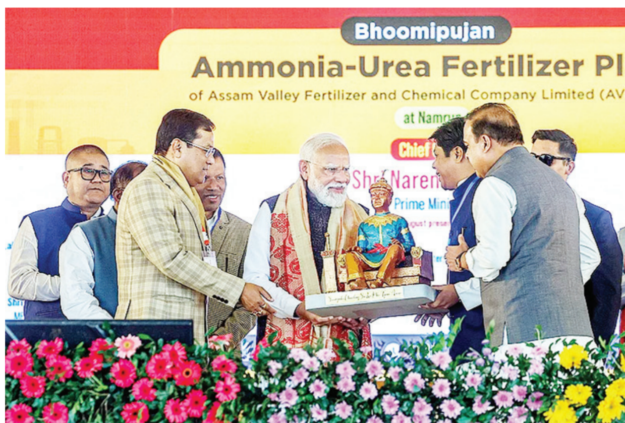
Prime Minister Narendra Modi during the foundation stone laying of Rs 10,601-crore brownfield ammonia-urea plant of Assam Valley Fertilizer and Chemical Company Ltd (AVFCL), at Namrup, in Dibrugarh district. Assam Chief Minister Himanta Biswa Sarma, Union Minister Sarbananda Sonowal and others were present at the occasion.

MI News Service, Srinagar: Over 35 students were injured when a bus they were travelling in turned turtle while returning from a picnic in Jammu on late Saturday evening, officials said. The incident took place at Ring Road near Ratnal in the Bishnah area. The condition of all the injured students was stated to be stable, the officials said. The bus was carrying 40 students and 10 members of the teaching staff from a school in the Pragwal border area. They were returning after a day-long picnic in Samba when the driver lost control of the vehicle after hitting a divider, causing it to overturn, they said. Rescue teams rushed to the spot immediately after the accident and shifted the injured students to hospital, the officials said.