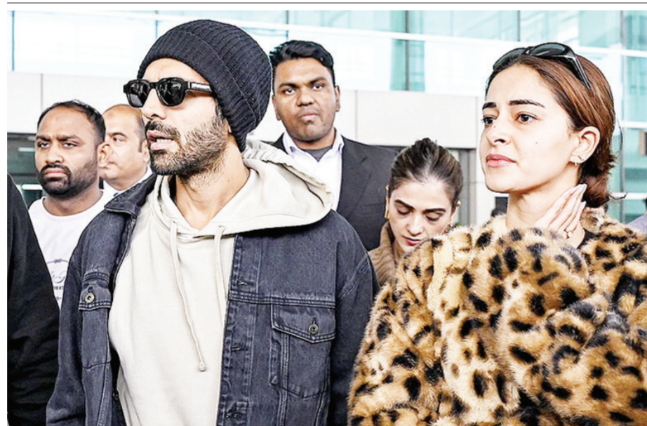
Bollywood Actors Kartik Aaryan and Ananya Panday arrive at Indira Gandhi International Airport, ahead of the launch of their film 'Tu Meri Main Tera Main Tera Tu Meri', in New Delhi.

As India advances with renewed purpose, Chartered Accountants continue to anchor the nation's economic momentum with integrity, insight, and innovation. ICAI's initiatives—strengthened standards, expanded global mobility, and future-ready reforms—reinforce its role as a trusted architect of financial resilience. The collective resolve of professionals, industry, and policymakers will define India's next leap, positioning the country as a global force in finance, governance, and sustainable development.