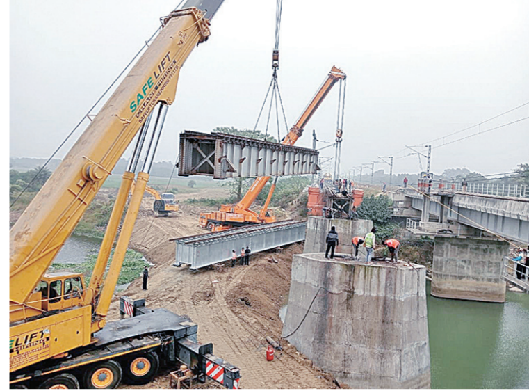
Simultaneously, the dismantling of the abandoned ROB on the Ballalpur-New Farakka UP and Down lines was completed. Removal of the obsolete structure has eliminated potential safety hazards and improved operational flexibility in the area. In addition to these major works, substantial progress was

From Renewal to Reliability: Eastern Railway Advances Infrastructure in the Azimganj-New Farakka Section MI News Service, Kolkata, 21 Dec.25 : The Engineering Department of Malda Division, Eastern Railway successfully executed the regrading of Bridge No. 336 and the dismantling of an abandoned Road Over Bridge (ROB) on December 20, 2025, in the Azimganj-New Farakka section. These works were carried out through meticulous planning and effective coordination under controlled traffic and power arrangements, thereby enhancing the safety, reliability, and operational efficiency of train services. The regrading of Bridge No. 336 was undertaken on the Jangipur Road-Sujinpara UP line of the Azimganj-New Farakka section. This critical renewal has significantly improved the structural strength and service life of the bridge, ensuring safer and smoother train operations.