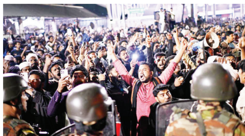
Thousands of protesters took to the streets in Bangladesh

In a statement on X, Yunus said that the Rapid Action Battalion (RAB) has arrested seven individuals as suspects in the case. The arrests were made during operations at various locations, and the ages of those arrested range from 19 to 46, the statement