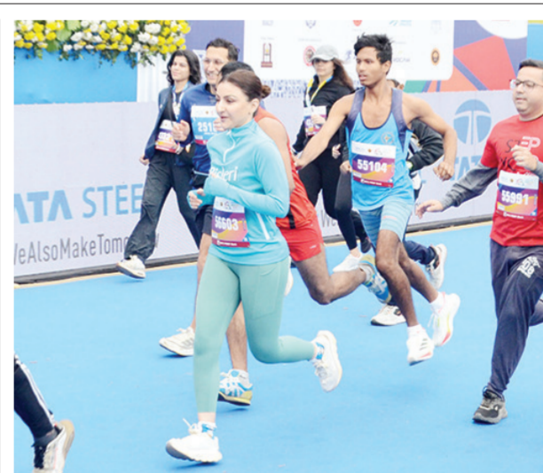
Bollywood actress Soha Ali Khan participates in a run during the Tata Steel World 25k Kolkata 2025 in Kolkata on Sunday.