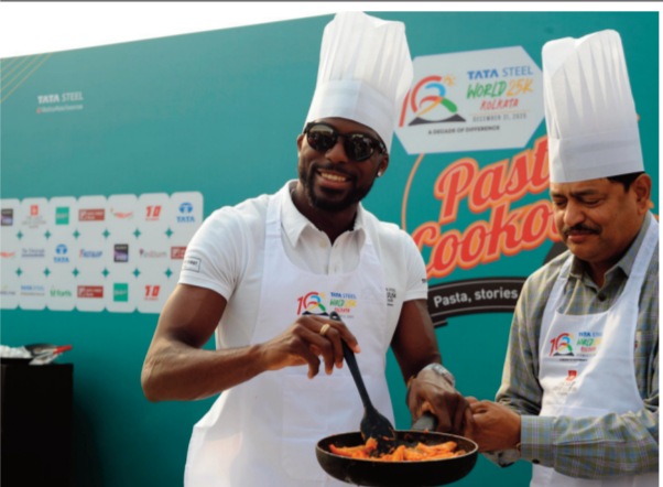
The Tata Steel World 25k Kolkata 2025 International event ambassador, Kenny Bednarek cooking pasta during an event, ahead of the Tata Steel World 25k Kolkata 2025, in Kolkata on Saturday.

In the draft electoral rolls published after the enumeration phase, 58,20,899 names have been excluded, reducing the electorate to 7.08 crore. Around 1.36 crore entries have also been flagged for "logical discrepancies", while 30 lakh voters have been categorised as unmapped – a significant percentage of whom are likely to be called for verification hearings over the next 45 days. For Matuas, a Dalit Hindu community that migrated from Bangladesh over decades due to religious persecution, this exercise has revived anxieties over identity and documentation.