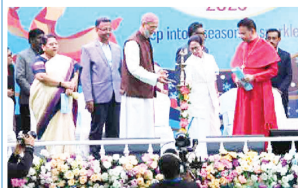
CM Mamata Banerjee inaugurated the Kolkata Christmas Festival by lighting the lamp at Allen Park in Kolkata.

MI News Service, Kolkata : West Bengal Chief minister Mamata Banerjee has underlined the humanity and geographical diversity of the state and said it has everything — from the deep sea to forests and mountains — and is second to none in drawing tourists from across the globe. "We have many famous places. We are now the second largest in tourism. So many foreigners have come round the year and every year", she said. According to the India Tourism Data Compendium 2025 compiled by the Union tourism ministry, Maharashtra recorded the highest number of foreign tourists in 2024, followed by West Bengal. The Chief minister also underscored the prevalence of humanity among