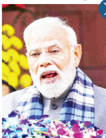
get rid of the 'maha jungle raj' in West Bengal," the PM said in his speech. He also promised rapid progress of Bengal

MI News Service, Kolkata / Ranaghat : Prime Minister Narendra Modi took a sharp jibe at the ruling Trinamool Congress in West Bengal through his virtual rally from Kolkata Airport on Saturday, saying that people across the state want to see the BJP in power after the next year's Assembly elections. "In an attempt to get rid of the Bihar-like jungle raj perpetrated by the Mamata Banerjee government, the people in Bengal want a change of the present government here", the Prime minister said. In a roughly 15 minute long virtual address from the Airport lounge, he said "Today the country wants rapid development. Bihar once again gave the NDA government a massive mandate for development... Bihar has also paved the way for the BJP's victory in Bengal. Bihar has rejected the rule of the 'jungle raj' with one resounding voice. Even after 20 years, they have given the BJP-NDA more seats than before. Now it's the turn of West Bengal, and we have to