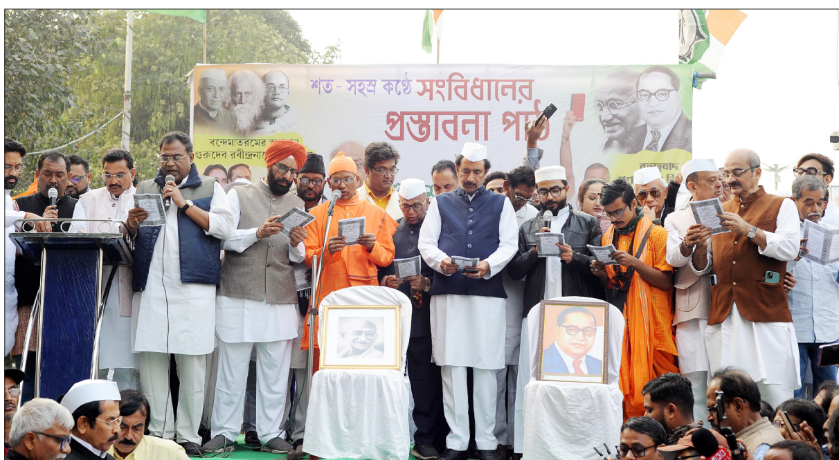
Congress activists participate in a 'Hundreds of thousands of voices to read the Constitution' called by West Bengal Pradesh Congress Committee, in Kolkata on Saturday.

The big cat had strayed into a densely populated locality and attacked seven people before being safely rescued. The operation, conducted under tight security and crowd-control measures, drew the attention of residents, many of whom gathered at a safe distance as the rescue unfolded. On Thursday, residents of Sahara City in Indore slept sound after the forest department successfully captured a five- to six-year-old male leopard that had been frequently sighted in the residential area for several days near the Devguradia forest area. Officials confirmed that the leopard's presence, set a trap, and after meticulous monitoring in the residential area, captured it by installing a cage. Villagers told the officials that the leopard had been hunting local dogs and had not shown aggression toward any humans.