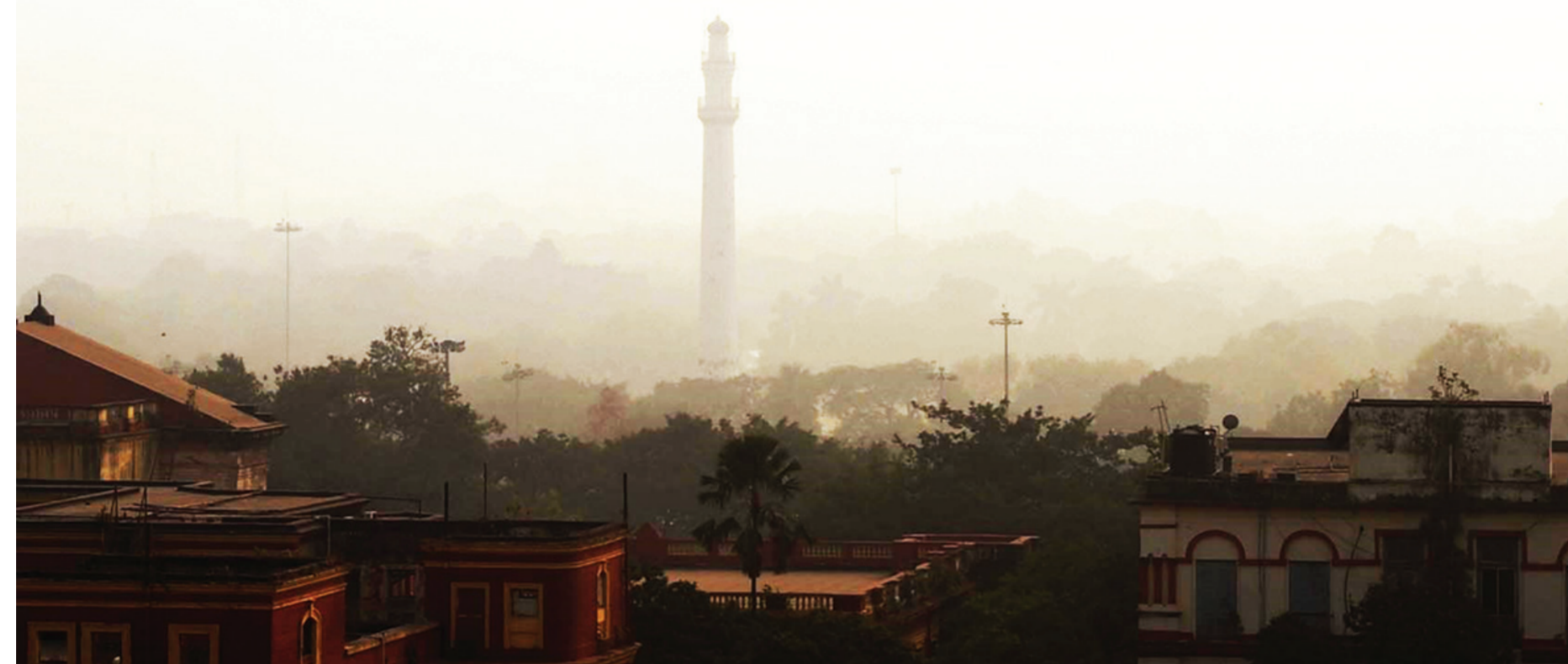
Dense fog blanketed the city on a winter afternoon around 2 pm, causing the iconic Shaheed Minar to disappear from plain sight at Maidan area in Kolkata on Saturday