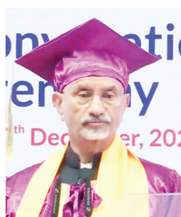
strong work ethic, with an aptitude for technology, who espouse a family-centric culture. "In conversations

"How does the world perceive us currently? The short answer is very much more positively and very much more seriously than before, and the reasons for that is both our national brand and our individual reputations, which have improved considerably," Jaishankar said. The minister said Indians are regarded today by the world as people with a