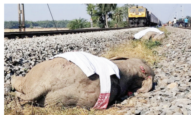
Bodies of elephants lie in between railway tracks after they were hit by a train in Hojai district in Assam,

MI News Service, Guwahati : In a most unfortunate incident at least seven elephants were run over and killed and another was injured when a herd of pachyderms was hit by the Sairang-New Delhi Rajdhani Express in Hojai district early on Saturday, an official said. According to official sources here today, the accident took place at around 2:17 a.m. when the New Delhi-bound Rajdhani Express struck a herd of elephants that was crossing the railway tracks. Forest department authorities later confirmed that seven elephants were killed in the collision, while one calf was rescued in an injured condition and provided medical attention.