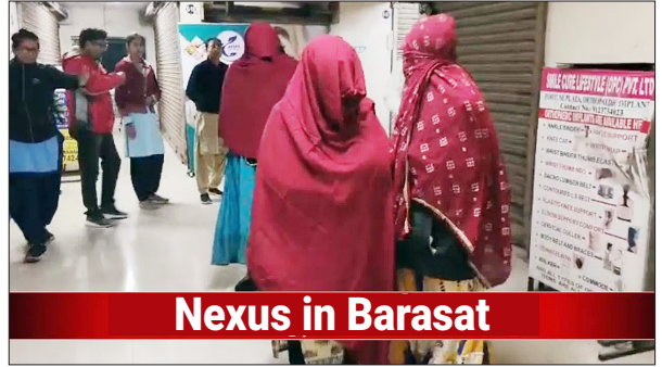
Nexus in Barasat

investigators have refrained from disclosing details regarding the exact circumstances of her disappearance or the location from where she was rescued, citing the sensitivity of the ongoing probe. Preliminary findings have raised serious concerns that the spa centre was allegedly being used as a front for illegal prostitution, with massage services serving as a cover. The establishment, according to