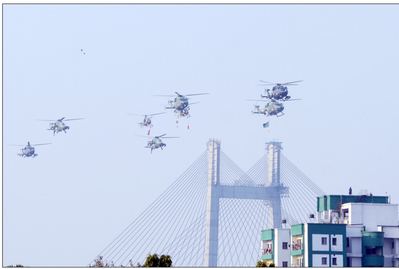
Army personnel stage a spectacular military tattoo on the eve of Vijay Diwas 2025 celebrations at the Royal Calcutta Golf Club in Kolkata on Monday.