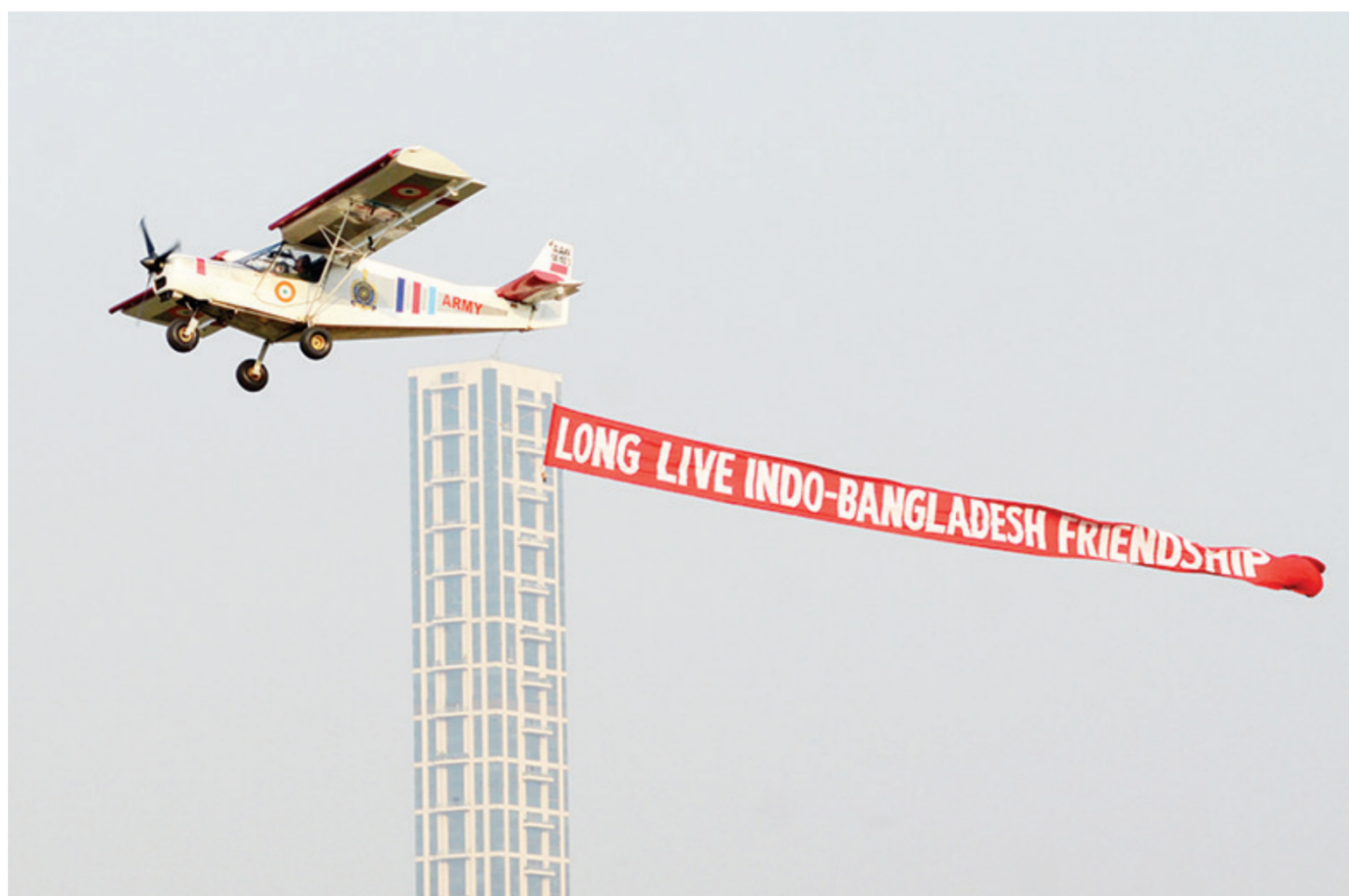
Army personnel perform military tattoos on the eve of Vijay Diwas 2025 celebration, at Royal Calcutta Golf Club in Kolkata on Monday.

From PG 1 Modi," he said. Stepping up the campaign on the issue of alleged election irregularities, top Congress leaders on Sunday attacked the BJP and the Election Commissioners at a 'Vote Chor Gaddi Chhod' rally in the national capital, alleging that "vote chori" is in the ruling party's DNA and its leaders were "gaddar" who were conspiring to take away voting rights of people and should be removed from power.