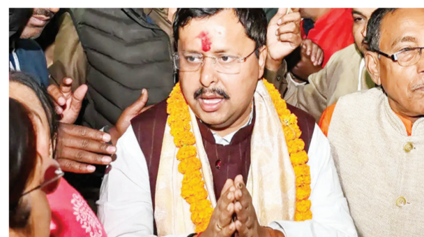
Bihar Minister Nitin Nabin being greeted by supporters in Patna after he was appointed BJP's national working president.

MI News Service, Patna / New Delhi : Newly-appointed National Working President of the BJP Nitin Nabin took charge of his new responsibility at the party headquarters here on Monday. BJP president and Union Health Minister J P Nadda, Home Minister Amit Shah, Education Minister Dharmendra Pradhan, among others, were present when Nabin took charge as the party's National Working President. Nabin arrived at the Indira Gandhi International (IGI) Airport here from Patna in the afternoon, a day after his appointment to the party post. He was received at the airport by Delhi Chief