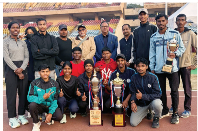
expressed immense pride and joy over the athletes' commendable performance at the university-level tournament.

On the occasion, all teachers and non-teaching staff of Ram Lakhan Singh Yadav College