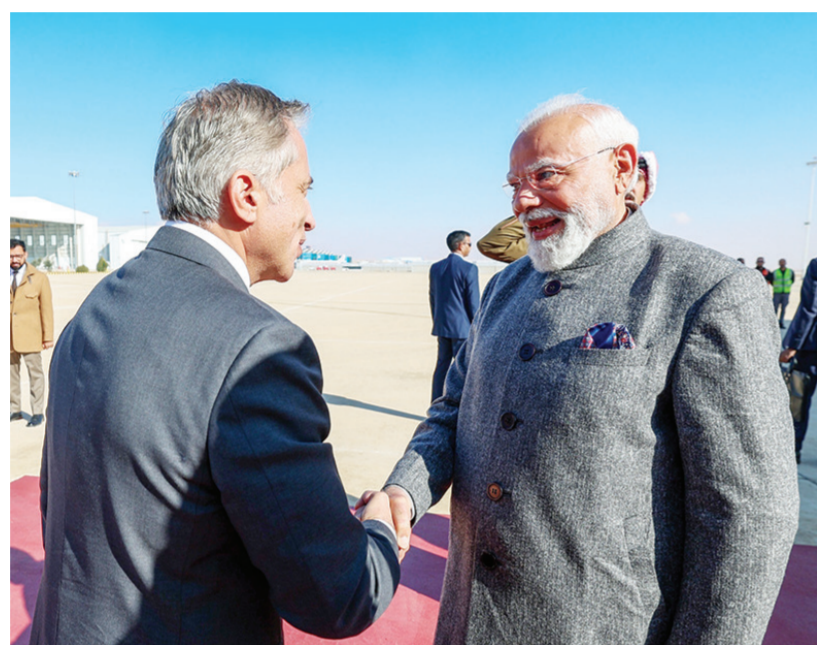
Prime Minister Narendra Modi receives a warm welcome from Jordan's Prime Minister, Jafar Hassan, on his arrival, in Amman on Monday.

MI News Service, New Delhi : Prime Minister Narendra Modi embarked on a three nation tour to Jordan, Ethiopia and Oman on Monday as all these countries enjoy civilizational ties and exceptional bilateral relations with key partners in West Asia and Africa. "First, I will be visiting Jordan, on the invitation of His Majesty King Abdullah II ibn Al Hussein. This historic visit will mark 75 years of establish-