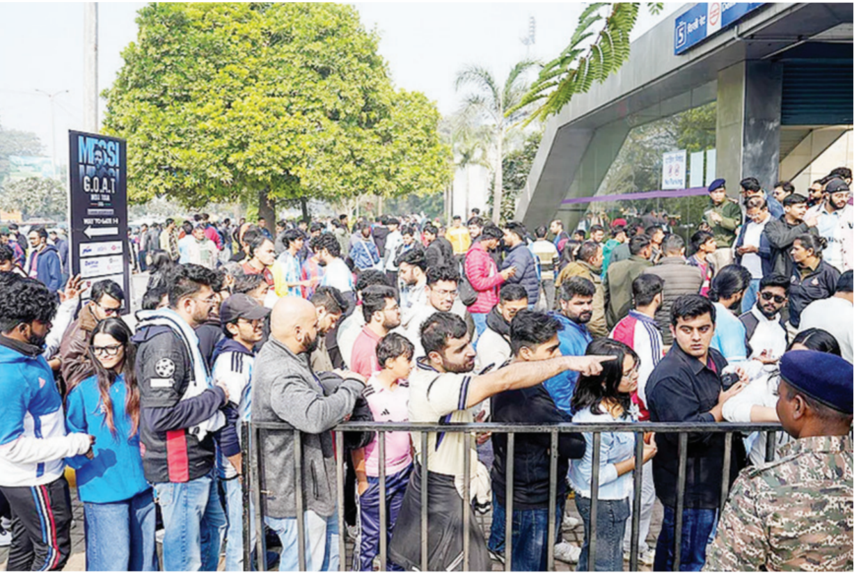
Fans of Argentinian footballer Lionel Messi gather outside Arun Jaitley Stadium ahead of the 'GOAT India Tour 2025' event, in New Delhi.