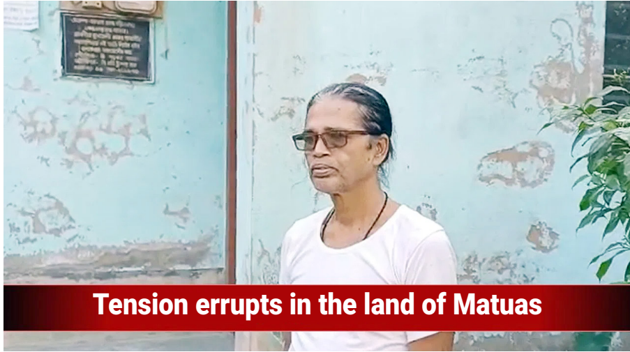
Tension erupts in the land of Matuas

The development follows a significant clarification by the Supreme Court on the implementation of the Citizenship Amendment Act (CAA). A Bench comprising Chief Justice Surya Kant and Justice Jaymalya Bagchi categorically held that only those who have been granted Indian citizenship are eligible to be included in the voter list. The court made it clear that merely applying for citizenship does not confer voting rights; applicants must first obtain citizenship before their names can be enrolled as electors. In the aftermath of this ruling, administrative activity appears to have intensified. According to local sources, thousands of applicants across North 24 Parganas received messages on their mobile phones requesting