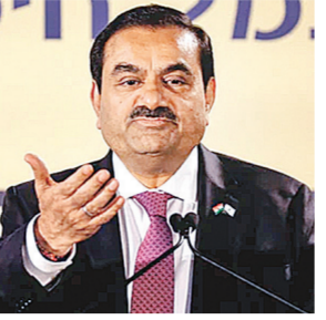
Adani said India is the world's third-largest electricity consumer but its per-capita consumption is "less than 1,400 kWh a year, less than half the global average, one-tenth of America, and one-fifth of Europe."

MI News Service, Mumbai: Adani Group chairman Gautam Adani said the conglomerate will invest over USD 75 billion in the energy-transition space over the next five years, asserting that India must define its own development path, resist external pressures and build sovereign capabilities in resources, energy and technology.