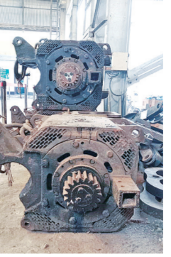
achievement marks a significant step forward in the Division's commitment to optimal asset management and financial efficiency.

MI News Service, Kolkata, 11 Dec.25 : Malda Division of Eastern Railway has achieved an unprecedented milestone in sustainable asset management and revenue optimization under the Zero-Scrap Mission.