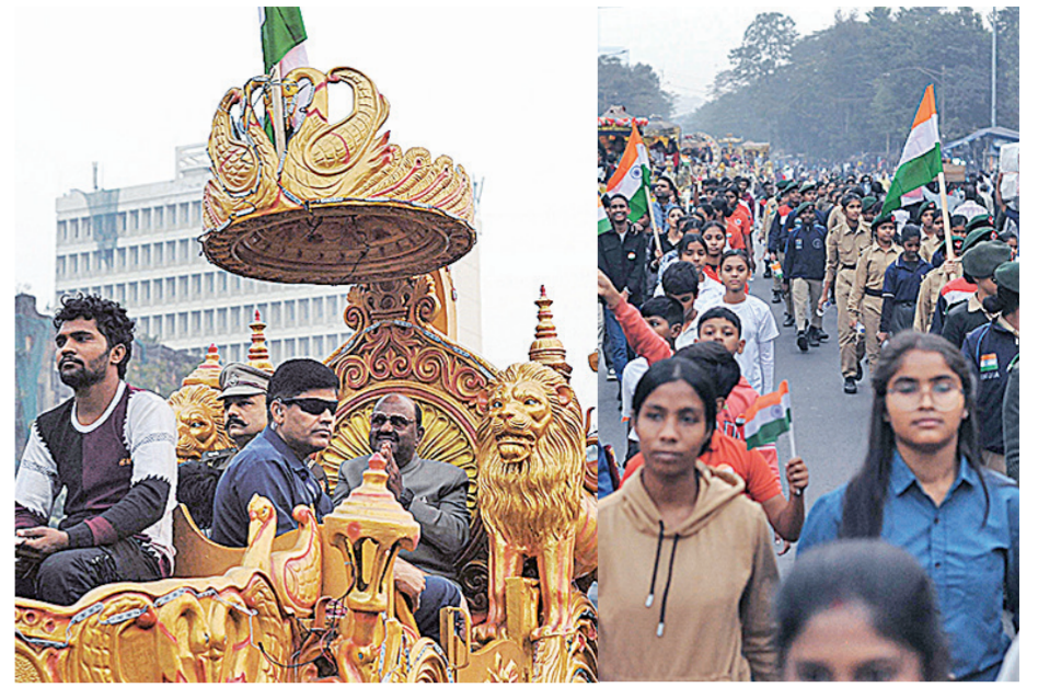
Governor of West Bengal, C. V. Ananda Bose with students and children participate in a Deepavali Jyoti March from Indian Museum to Lok Bhawan (Raj Bhawan), in Kolkata on Thursday.

Banerjee concluded her speech by assuring citizens that "no one will be driven out of their homes" under her watch, positioning her government as a bulwark against policies she described as discriminatory.