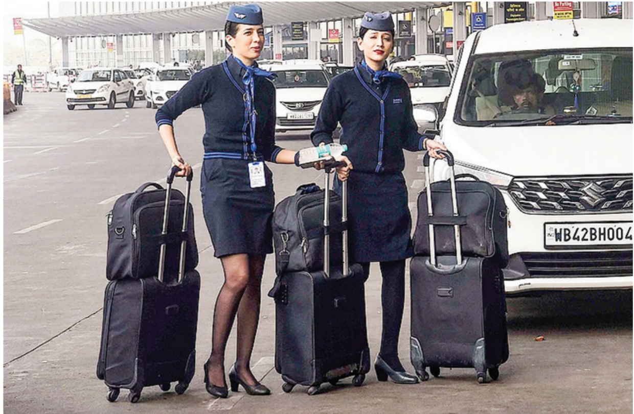
Cabin crew personnel at Netaji Subhas Chandra Bose International (NSCB) Airport after normalcy was restored at many airports across the country following the recent Indigo crisis, according to officials, in Kolkata.