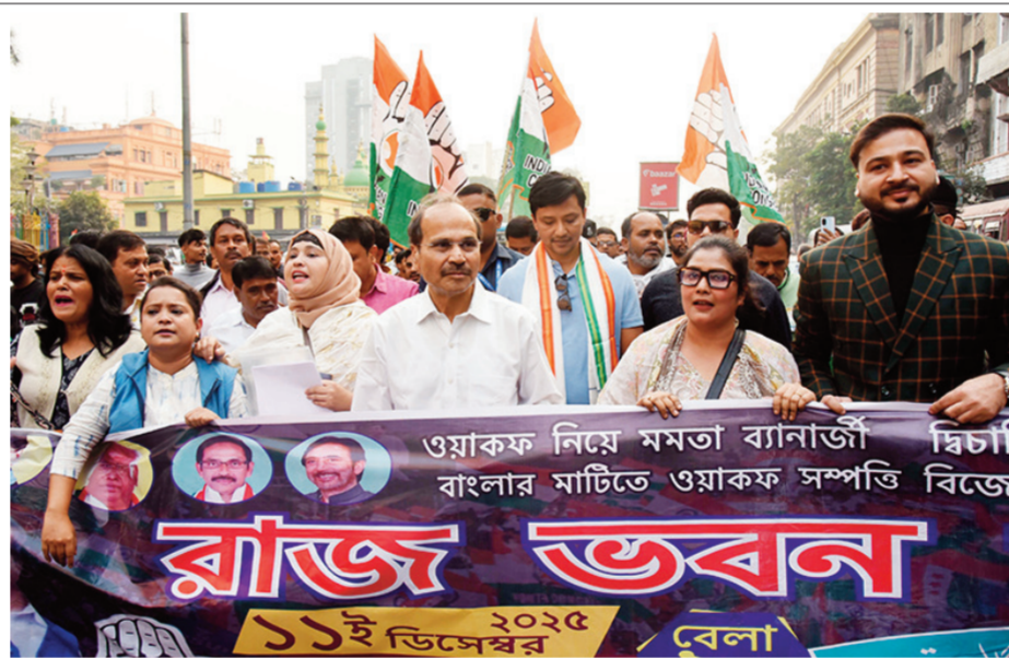
Congress leader Adhir Ranjan Chowdhury with members of West Bengal Youth Congress took part in a protest rally during their march to Raj Bhavan regarding the Waqf Act and the BJP's conspiracy to loot Waqf properties, in Kolkata on Thursday.

5, 2024. Three days later, Yunus took over as the Chief Adviser of the Interim Government which soon disbanded Hasina's Awami League. Sheikh Hasina, the 78-year-old Awami League leader who has been convicted and sentenced to long imprisonment and death, has been living in India in exile since she fled the country.