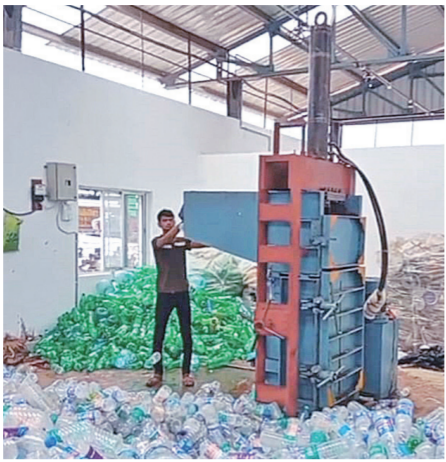
The larger mission of reducing carbon emissions. By ensuring that discarded PET bottles are recycled efficiently, Howrah Division is making a meaningful contribution to environmental conservation while promoting sustainable practices within Indian Railways.

MI News Service, Kolkata, 11 Dec.25 : Howrah Division has undertaken a significant initiative aimed at reducing plastic waste and creating a cleaner, more sustainable environment for the future.