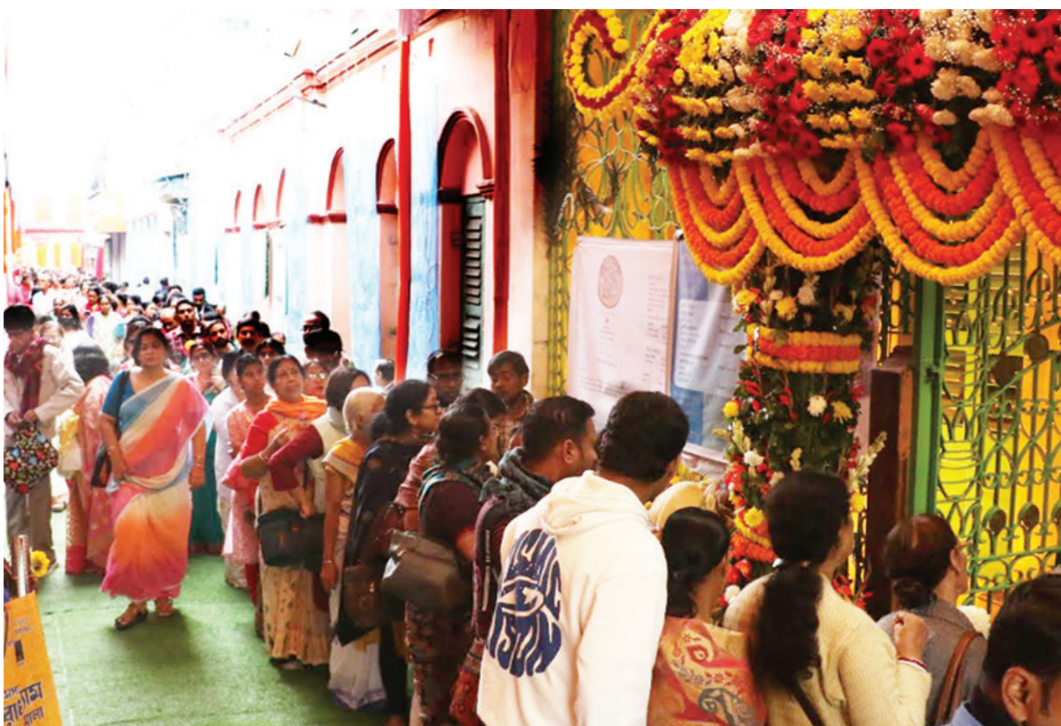
The 173rd birth anniversary of Sri Sarada Devi celebrated at Sri Sri Mayer Bari at Bagbazar, in Kolkata, on Thursday.

From PG 1 Birch by Romeo Lane didn't have extinguishers, alarms, suppression gear, and a fire audit on record - all of which are basic fire-safety rules. Furthermore, police said that the owners, manager, partners, event organiser and senior staff conducted a fire act at the venue "without taking proper care and caution" and despite "full knowledge" that it could lead to a deadly accident. The FIR also cited that the nightclub lacked emergency exits on both the deck and the ground floor, which led to several guests being trapped in flames. Efforts to catch the Luthra brothers had been amped up, with Goa Chief Minister Pramod Madhav vowing to arrest them soon and warning other clubs in the coastal state to abide by safety rules lest they face crackdown by authorities. A second club owned by the duo, a shack in Goa, was demolished on Madhav's direction as it was illegally constructed and lacked safety measures.