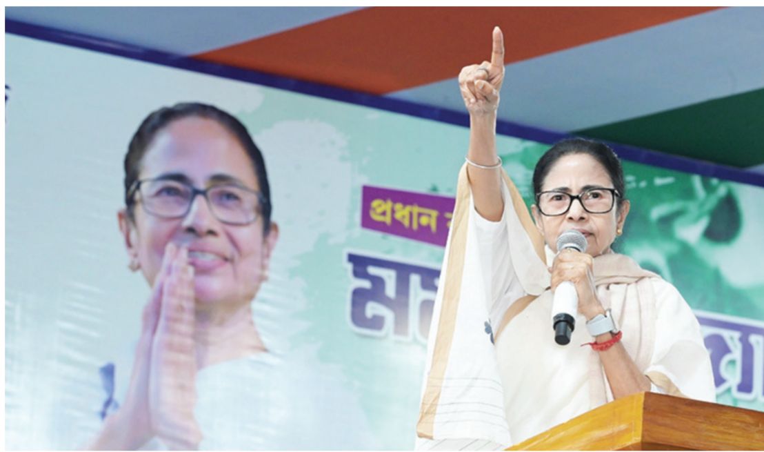
West Bengal CM Mamata Banerjee is addressing a huge rally at Krishnanagar in Nadia district on Thursday

MI News Service, Kolkata / Krishnanagar : West Bengal Chief Minister Mamata Banerjee on Thursday once again intensified her attack on Union Home Minister Amit Shah, calling him "dangerous" and accusing the Centre and the Election Commission of using the SIR of electoral rolls to unlawfully delete names of lakhs of eligible Bengali voters ahead of the 2026 assembly polls. Addressing a huge rally at Krishnanagar, the district headquarters of Nadia, about 100 km from Kolkata this afternoon, Mamata Banerjee alleged that Shah was directly guiding attempts to remove as many as "1.5 crore names" from the voters' list, and warned that she would sit on an 'indefinite dharna' if even a single eligible voter was excluded during the SIR exercise. "The country's Home minister is dangerous. His two eyes send a message of disaster — in one eye you see Duryodhan, and in the other, Dushasan," the Chief minister said, dramatically intensifying the rhetoric she has been using over the past week in her public meetings. She also accused the BJP of attempting to weaponise the SIR exercise barely two to three months before the polls. "They are so hungry for votes that they have