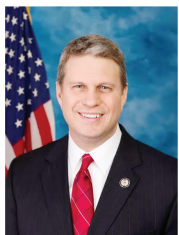
the rules, then our partnership with India is critical," Huizenga

Bill Huizenga on Thursday at a subcommittee hearing titled "The US India Strategic Partnership: Securing a Free and Open