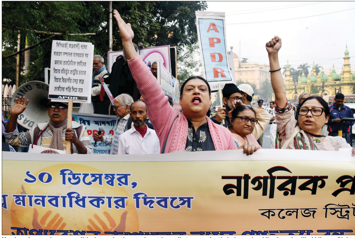
Members from various non-political organisations took part in a rally to press for their demands while observing World Human Rights Day, in Kolkata on Wednesday.