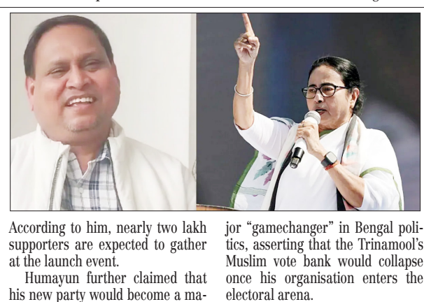
According to him, nearly two lakh supporters are expected to gather at the launch event.