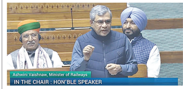
Ashwini Vaishnaw, Minister of Railways IN THE CHAIR - HON'BLE SPEAKER

upgraded to future-ready standards. Already, 160 stations have been redeveloped. From modern engineering solutions to enhanced passenger facilities, each project is being implemented in a phased and meticulously planned manner so that stations can evolve into world-class transit hubs while continuing to serve the lifeline of the nation.