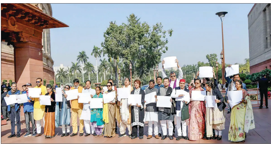
Trinamool Congress MPs staged a protest in Parliament complex on Wednesday, demanding that Centre should come out with a White Paper on funds allocated to West Bengal under MGNREGS.

"We have not received Rs 51,627 crore for MGNREGA. They have kept this money hidden.