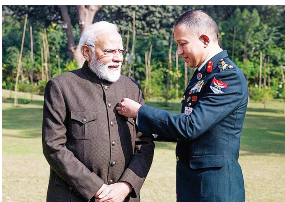
PM Narendra Modi receives a badge on the occasion of the Armed Forces Flag Day.