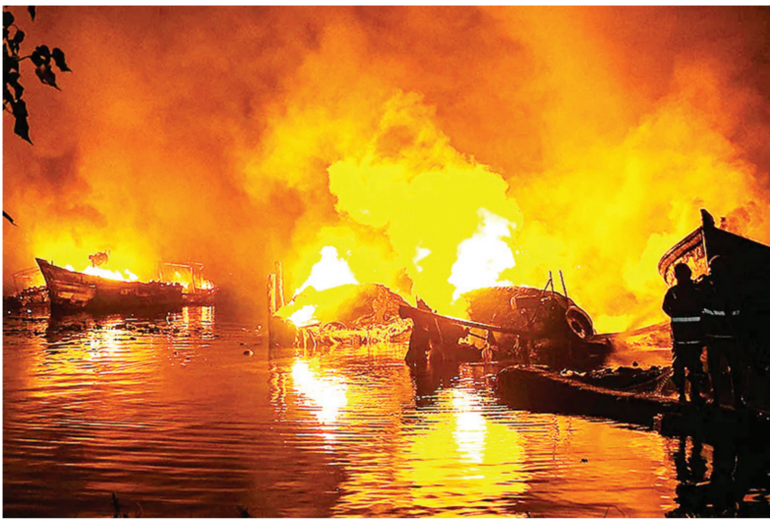
Smoke and flames billow after fishing boats caught fire, at Ashtamudi Lake in Kollam, Kerala. Around 10 boats, anchored at the lake, were gutted in the incident.

The bench, however, noted that the issue of noise pollution was recurring. "Noise pollution is a serious threat to public health and welfare. It causes 'fight or flight' syndrome, releasing cortisol and other harmful chemicals into the bloodstream," the court said.