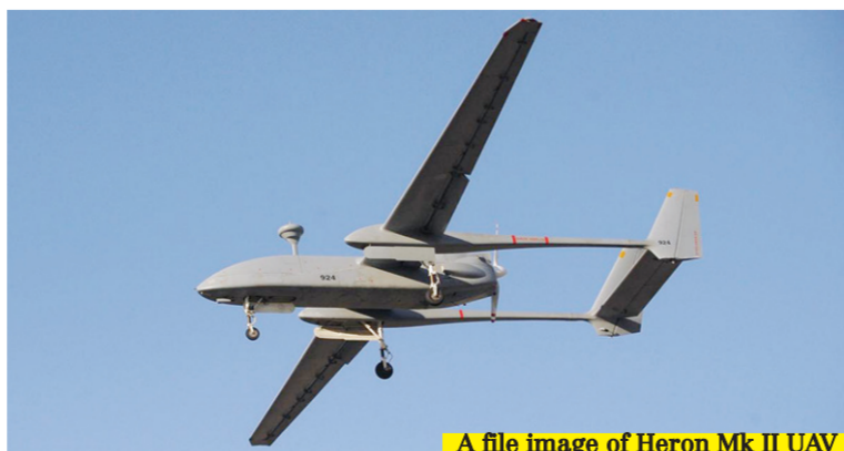
A file image of Heron Mk II UAV

At present, the army, navy and air force operate a significant number of Israel-origin Heron Mark-I and Mark-II drones from their own bases. These unmanned aerial vehicles (UAVs) were also extensively used for intelligence, surveillance and reconnaissance during Operation Sindoor against Pakistan in May. "We are soon going to procure more Heron drones, especially the more advanced Mark II which will significantly enhance India's surveillance capabilities along the Line of Control with Pakistan and Line of