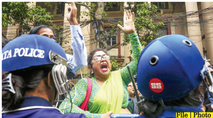
Booth Level Officers (BLOs) protesting alleged excessive workload during the ongoing Special Intensive Revision (SIR) of electoral rolls in Kolkata.

MI News Service, Kolkata: The Election Commission has asked election officials in districts to identify booth-level officers (BLOs) who did not do their work properly during the special intensive revision (SIR) of the voter list, indicating that steps could be initiated against those found responsible for uploading lakhs of erroneous enumeration forms. The move, sources said, was significant as it appeared that the EC wanted to send a message to the officials, who would be conducting the hearing and verification of voters, that errors in carrying out the SIR process would not be tolerated.