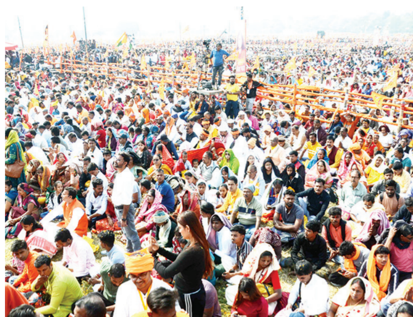
The Brigade Parade Ground in Kolkata on Sunday experienced the footfall of lakhs of Hindu devotees who participated in the iconic 'GITA' recitation Utsov.

From PG 1 regularly to monitor the situation. The company's Board of Directors is doing everything possible to take care of the challenges faced by its customers and ensure refunds to passengers, it said.