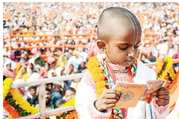
A child reads Gita during the Gita Path spiritual program organised by Sanatan Sanskriti Sansad at Brigade Parade Ground, in Kolkata on Sunday.