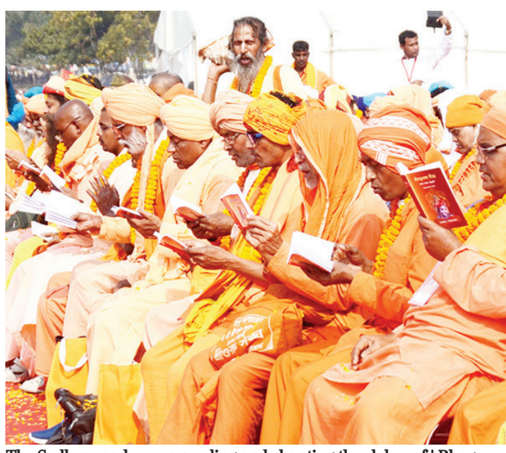
The Sadhus can be seen reading and chanting the slokas of 'Bhagawat Gita' with full devotion and discipline at the Brigade Parade Ground in Kolkata on Sunday at the Holy occasion of 'Gita Recital Ceremony'.