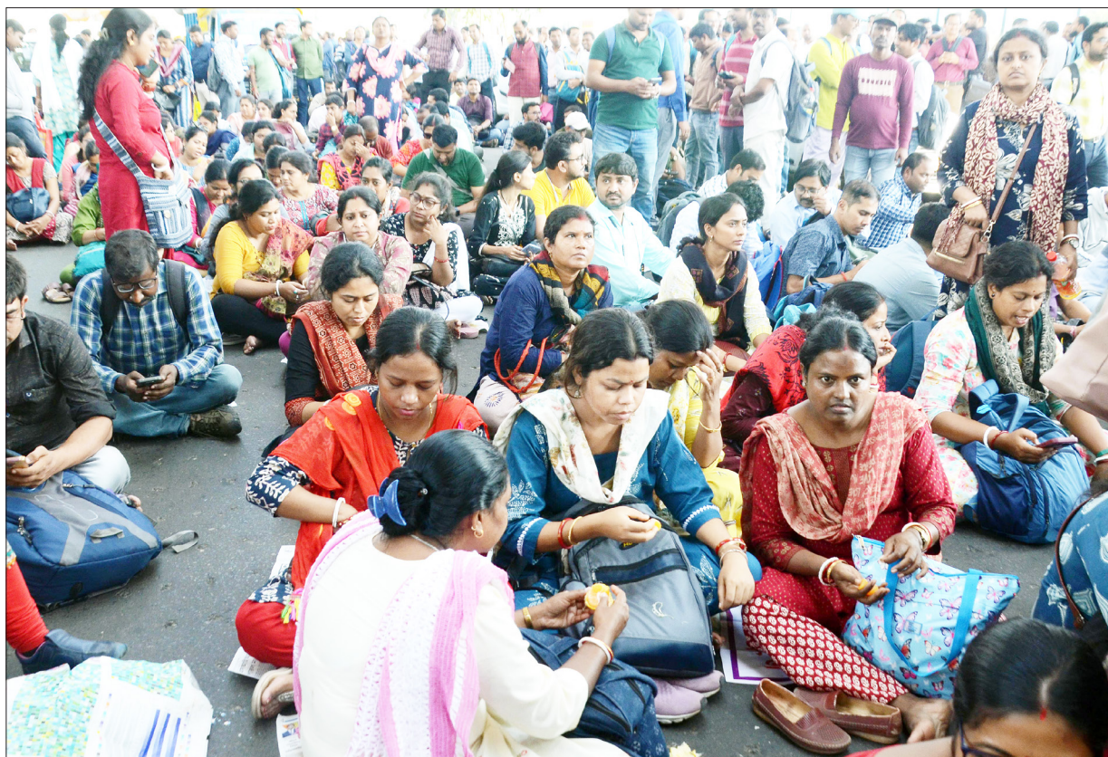
Protesting teachers and SLST 2016 candidates from the Joggo Shikhhok Shikhhika Adhikar Manch took part in a rally demanding permanent jobs during their march to Bikash Bhavan, Salt Lake, in Kolkata on Tuesday.