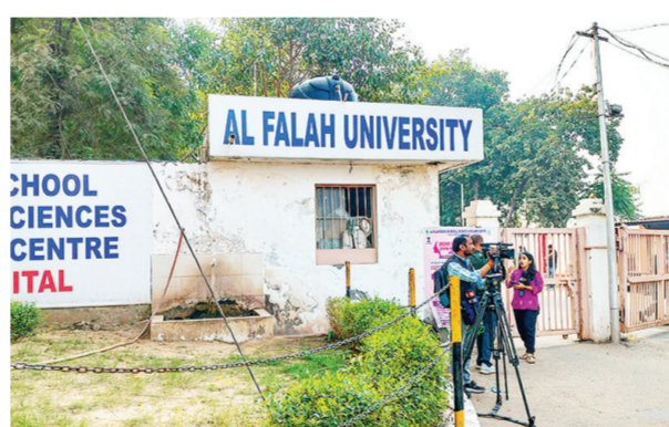
Media persons outside the Al Falah School of Medical Sciences and Research Centre, in Faridabad, Haryana. The Enforcement Directorate on Tuesday launched searches against the Al Falah University of Faridabad and linked persons as part of its investigation related to the Delhi blast case.

MI News Service, New Delhi : The Enforcement Directorate on Tuesday conducted simultaneous raids and searches in Delhi-NCR against the trustees and promoters of Al Falah University of Faridabad, which has become the focal point in last week's car blast case near the Red Fort, official sources said. Multiple teams of the federal probe agency raided at least 25 premises of the Al Falah trust and University establishment since 5:15 am this morning, the sources said.