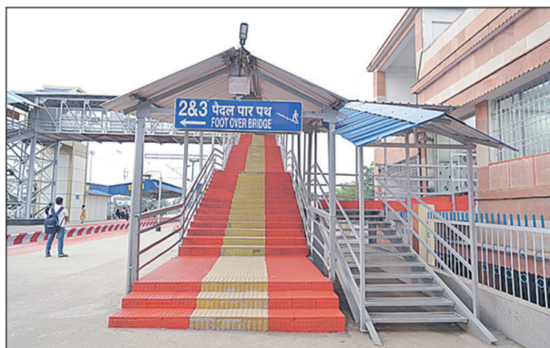
Redeveloped Piska station under Amrit Bharat Station Scheme.

is done in phases, based on what each station needs. The goal is to make stations cleaner, more comfortable, and easier to use. Piska Railway station under jurisdiction of Ranchi division in Ranchi district, Jharkhand, is among the stations being upgraded under the Amrit Bharat Station Scheme. The redevelopment work aims to transform the modest station with more passenger-centric amenities. The redevelopment of Piska Railway Station is expected to benefit thousands of daily passengers from Ranchi and surrounding areas. Enhanced