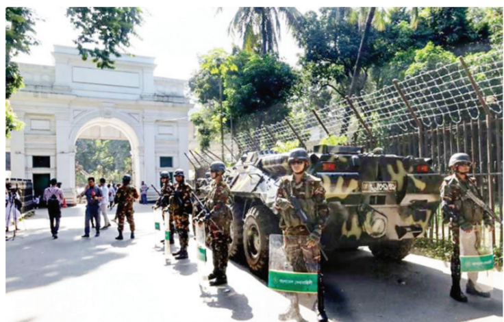
Bangladesh under tight security as Awami League calls shutdown after Hasina verdict.

MI News Service, Dhaka / New Delhi : A day after former Prime minister Sheikh Hasina and his ex Home minister were sentenced to death by a Tribunal, Bangladesh remained calm but tense on Tuesday as security forces kept a round the clock vigil and tight grip on the streets across major cities, in the wake of the Awami League's call for a "nationwide total shutdown" to protest the death sentences.