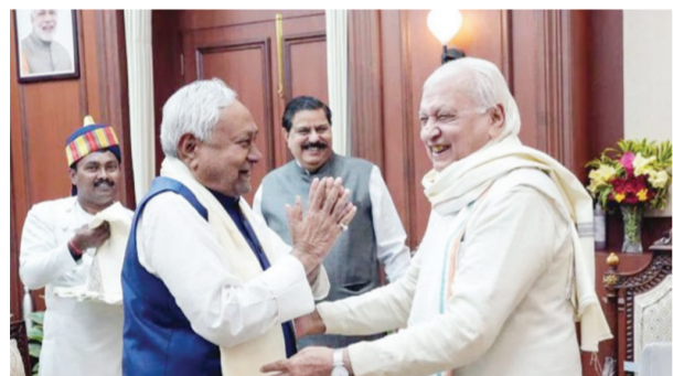
Bihar Chief Minister Nitish Kumar and Governor Arif Mohammad Khan

MI News Service, Patna : The outgoing Bihar Chief Minister Nitish Kumar was "authorised" to recommend dissolution of the current assembly in the last cabinet meeting of the NDA government in the state on Monday, official sources said. A resolution to this effect was unanimously passed in the meeting, which lasted for only about 10 minutes under the chairmanship of Nitish Kumar, they said. "The Chief minister met Governor Arif Mohammad Khan soon after the meeting to apprise him of the cabinet